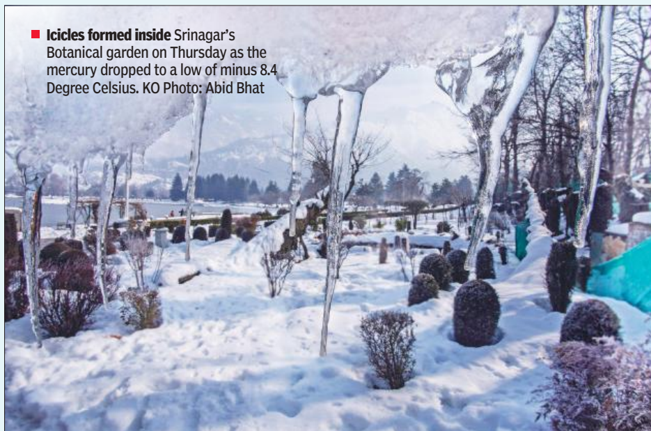
■ Icicles formed inside Srinagar's Botanical garden on Thursday as the mercury dropped to a low of minus 8.4 Degree Celsius.