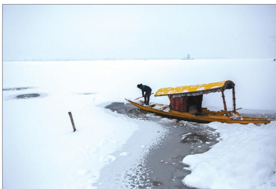
A BOATMAN CLEANING his Shikara inside the snow-covered Dal Lake on Saturday.