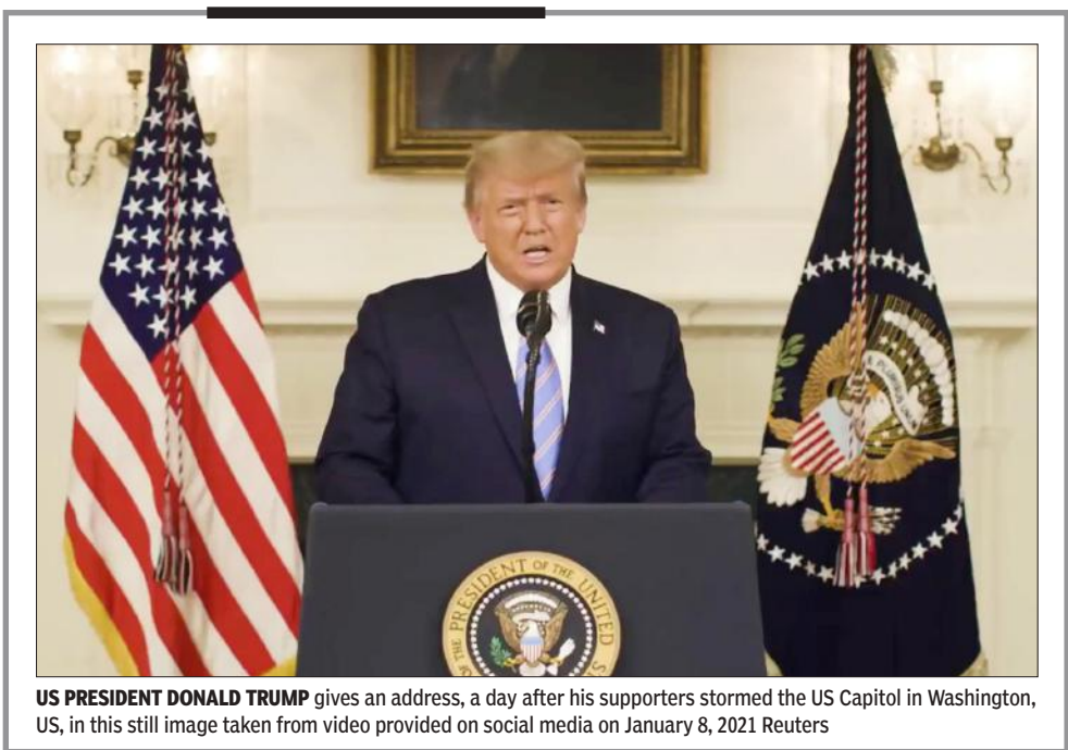
US PRESIDENT DONALD TRUMP gives an address, a day after his supporters stormed the US Capitol in Washington, US, in this still image taken from video provided on social media on January 8, 2021

Tensions between Washington and Tehran have been on the rise since 2018, when President Donald Trump abandoned a 2015 nuclear deal and re-imposed sanctions.