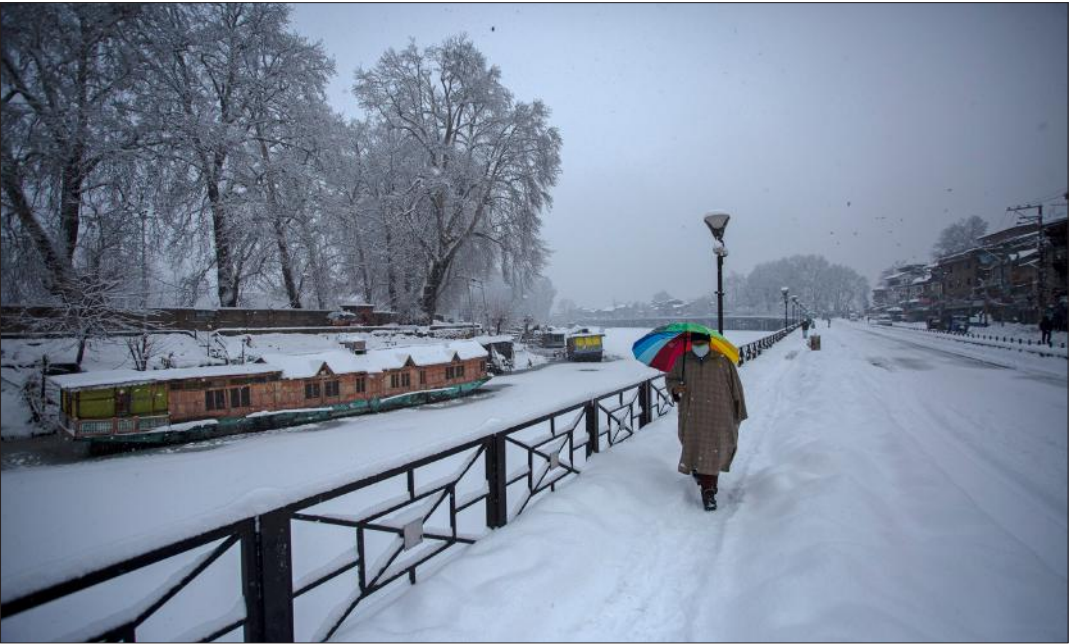
SNOW LAND: A man walks along the deserted banks of Dal side waters near Dalgate

Kashmir government on Thursday had announced a complete ban on import of poultry items into the Union Territory till January 14. "In the wake of spread of bird flu in neighbouring states of J&K as a measure of abundant precaution and in view of declaration of whole J&K as "Controlled Area" for bird flu disease. Government of UT J&K imposes complete ban on import of live birds including poultry and unprocessed poultry meet for any purpose into the union territory of J&K with immediate effect," the order issued by Navin K Choudhary, Principal Secretary to the government read. It had further said that the decision on the import ban will be reviewed based on the evolving situation. The order on banning poultry imports come a day after government had said that no cases of bird flu or avian influenza have been detected in the union territory. --(With KNO inputs)