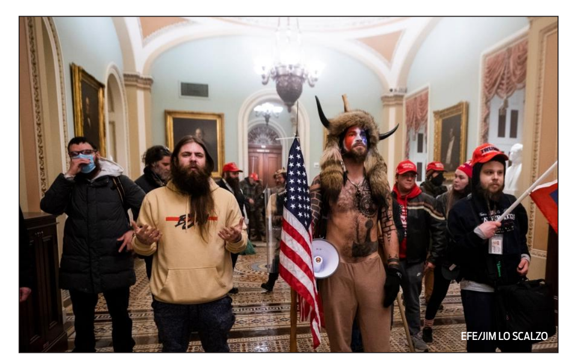
Once the dust settles, Trump's actions are sure to be a great source of embarrassment to him. As such, Trump remains one of the very few American Presidents to have served for just a single term. It is probably this humiliation that provoked him to get his supporters to march to Capitol Hill in the first place.

Trump has been temporarily blocked by Facebook, Twitter and YouTube. The Republicans themselves are divided over the aggression, with Vice President Mike Pence declaring that he isn't a party to the protests. Is such a split within the ruling dispensation possible in India? After all, the Congress as solit up several times, especially when Prime