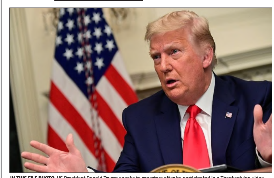
IN THIS FILE PHOTO, US President Donald Trump speaks to reporters after he participated in a Thanksgiving video teleconference with members of the military forces at the White House on Nov 26, 2020.