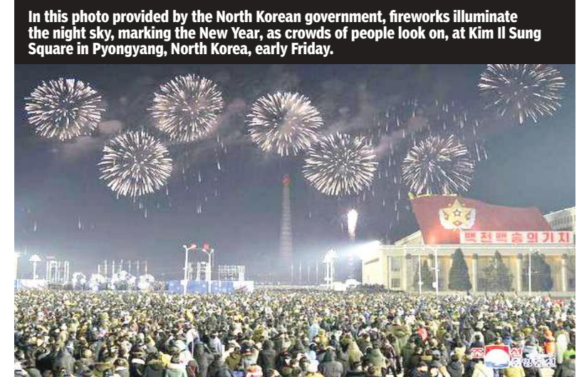
In this photo provided by the North Korean government, fireworks illuminate the night sky, marking the New Year, as crowds of people look on, at Kim Il Sung Square in Pyongyang, North Korea, early Friday.

In recent days, social media has been filled with videos showing mask-less revellers enjoying a night out and television channels have even shown live images of police closing bars full of customers.