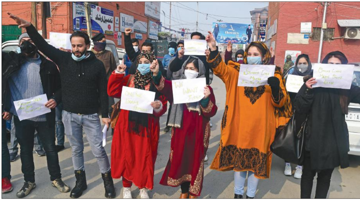
KASHMIR UNIVERSITY law students stage a protest in press enclave Demanding online topic based exam.

"Therefore, it's important for parents to avoid restricting the children's screen time but instead trying to instil a sense of normalcy within their routine. We can create opportunities to stimulate their mind, for instance by encouraging them to pick up some new hobbies, skills or activities," he explained. Dr Parikh added that involving in household activities in the form of a fun based activity, participating with children and family can be a good option.