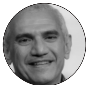
Muhammad H Fadel

There is substantial evidence that an important number of prominent European intellectuals of the Renaissance and the Enlightenment were, if anything, Islamophiles