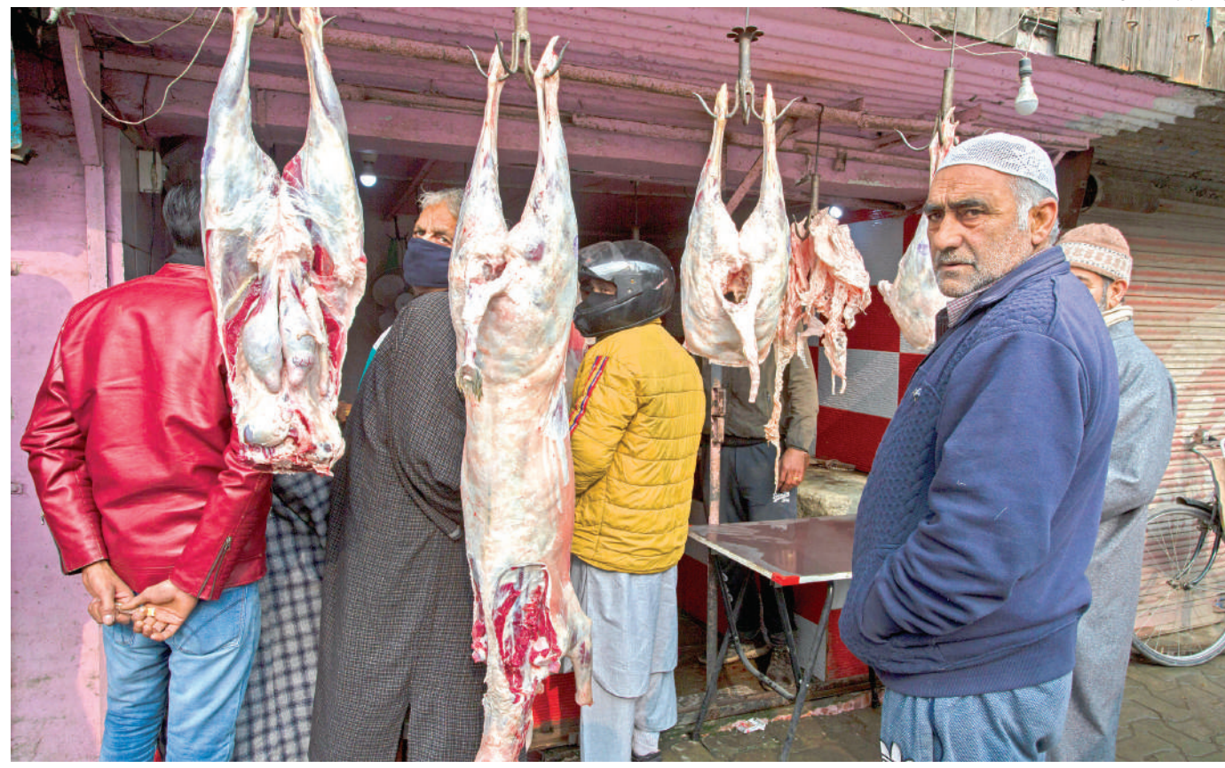
PEOPLE STAND IN A QUEUE OUTSIDE a mutton shop in Srinagar on Friday as the stalemate over prices continues between dealers and authorities.