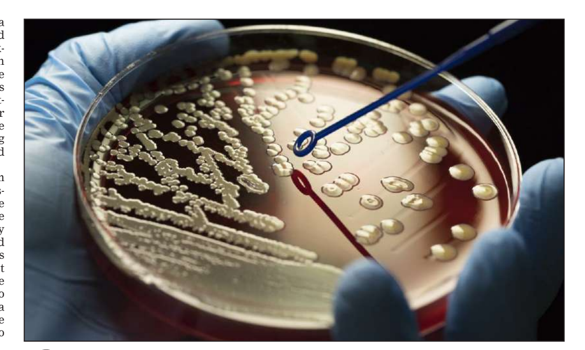
Losing antibiotics to fight bacterial infections is almost imaginable. There would be no organ transplants or joint replacements, routine surgeries could become life threatening and a simple cut could kill

Losing antibiotics to fight bacterial infections is almost imaginable. There would be no organ transplants or joint replacements, routine surgeries could become life threatening and a simple cut