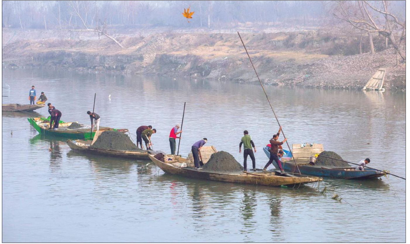
A GROUP OF BOATMEN extracting sand from river Jhelum in Sumbal area of Bandipora district on Wednesday.

"The government must treat the farmers with dignity and allay their apprehensions on the farm Acts. We wholeheartedly support the cause of the farmers and look forward to a peaceful and amicable resolution of their issues raised by the Government," it said.