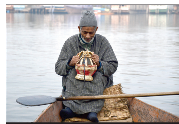
KO Photo: Abid Bhat