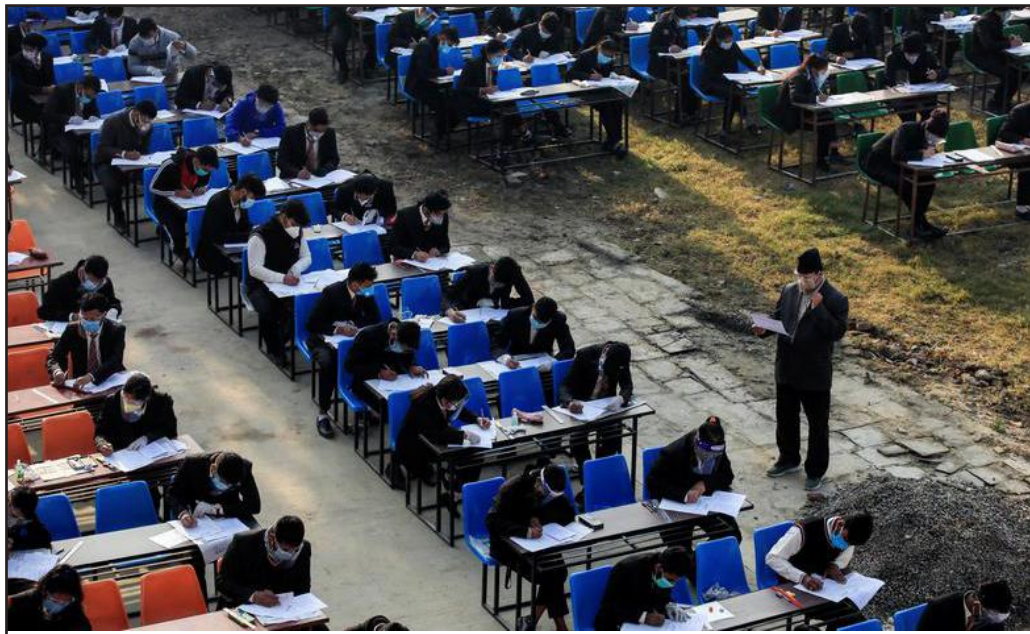
Students maintaining social distance and wearing protective face masks attend their grade 12 exams, amid the spread of the coronavirus, in Kathmandu, Nepal.

Australia sent troops to join the US-led forces that tried to defeat the Taliban insurgency in Afghanistan in the years after the militants were forced from power in 2001.