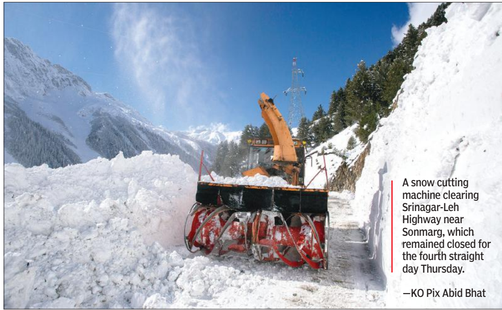
A snow cutting machine clearing Srinagar-Leh Highway near Sonmarg, which remained closed for the fourth straight day Thursday.