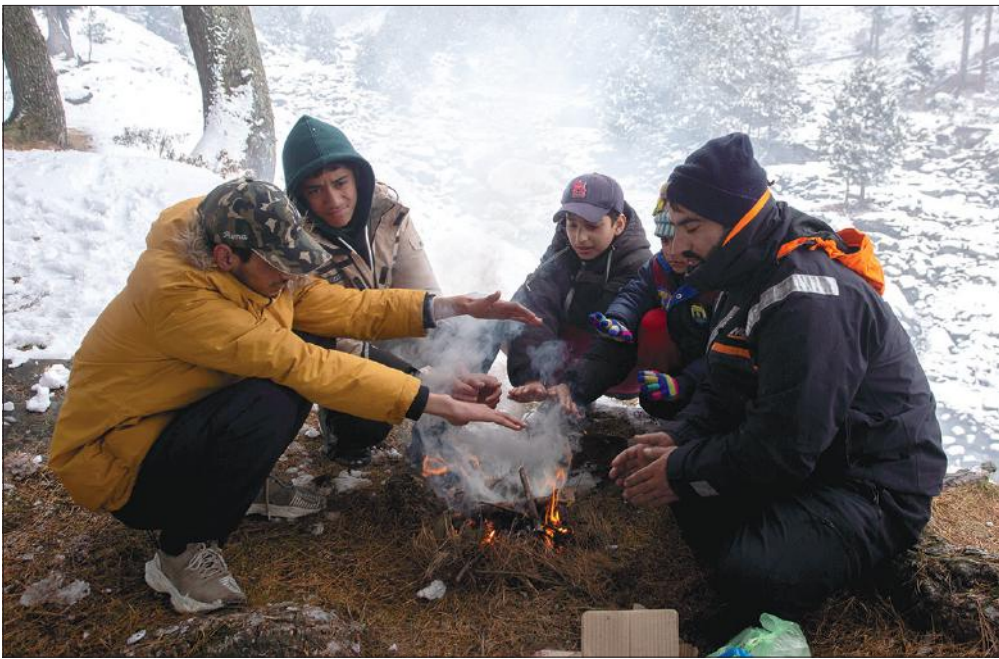
A GROUP of boys warm themselves while sitting around a bonfire in snow-covered Yusmarg.

He was also the convenor of the Persecuted Prisoners Solidarity Committee (PPSC), a frontal organisation of the CPI(Maoist), the NIA claimed. Swamy in his bail plea denied the allegations and said that the prosecution had failed to bring on record any evidence. —PTI