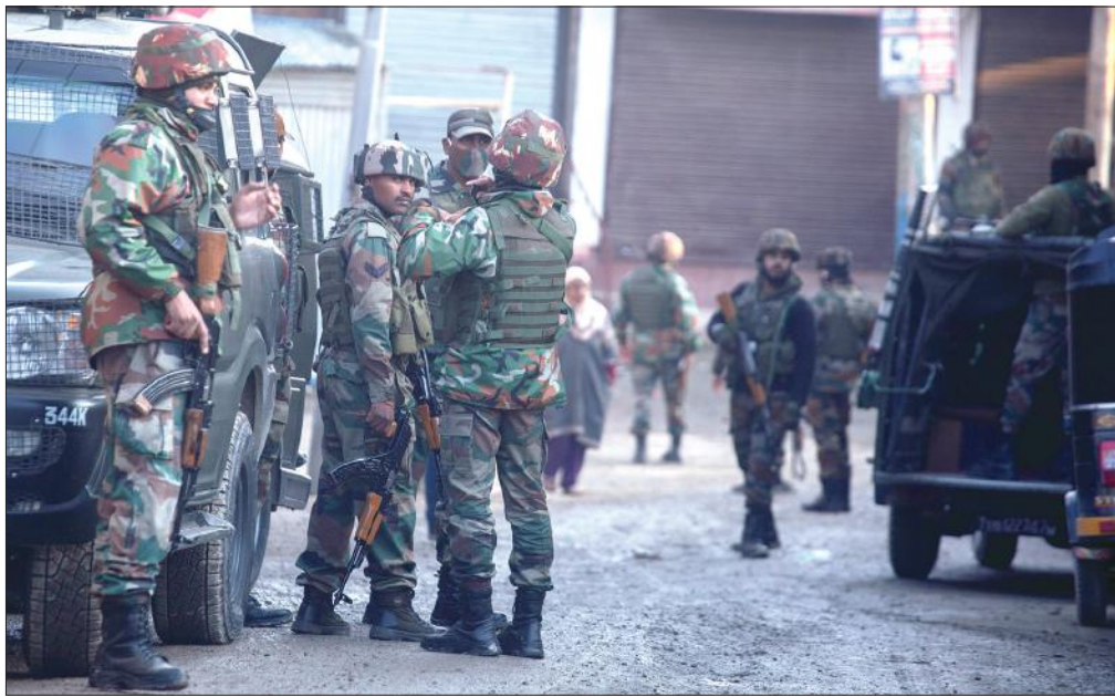
KD Photo: Abid Bhat