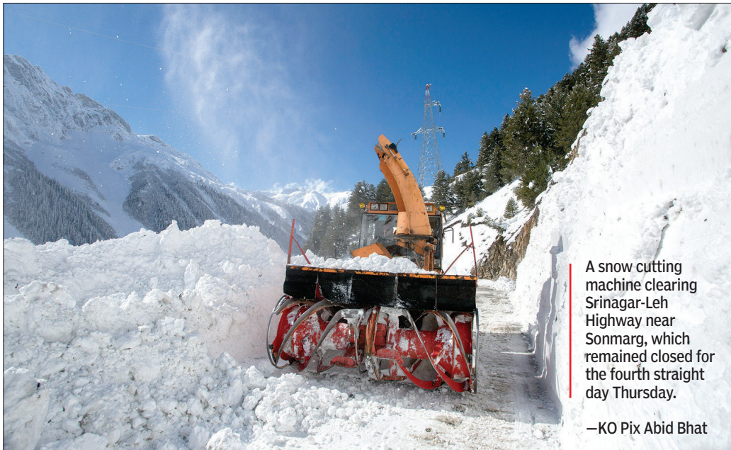
A snow cutting machine clearing Srinagar-Leh Highway near Sonmarg, which remained closed for the fourth straight day Thursday.