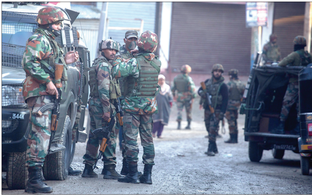
KD Photo: Abid Bhat