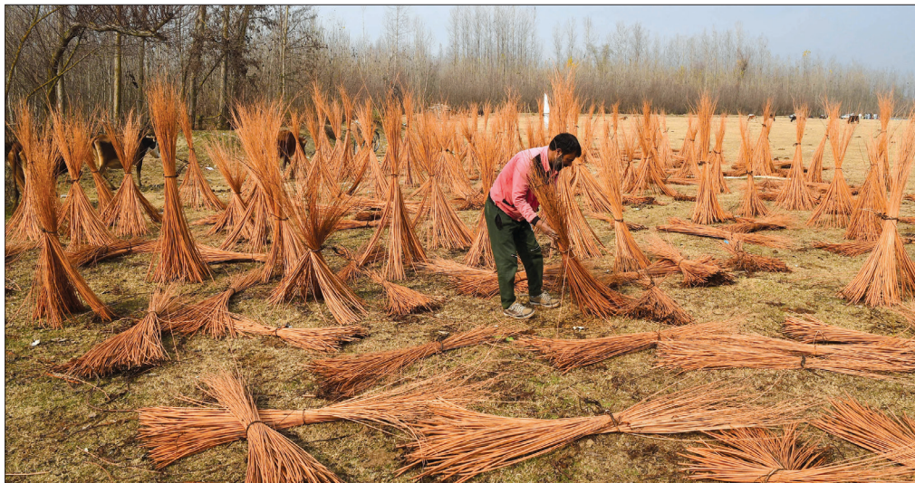
A VILLAGER ties a bundle of polished withies in an open field in Srinagar outskirts on Saturday.

The maximum day temperature 23.5°C was recorded in Jammu while Kashmir capital Srinagar recorded a temperature of 10.2°C (With KNT inputs)