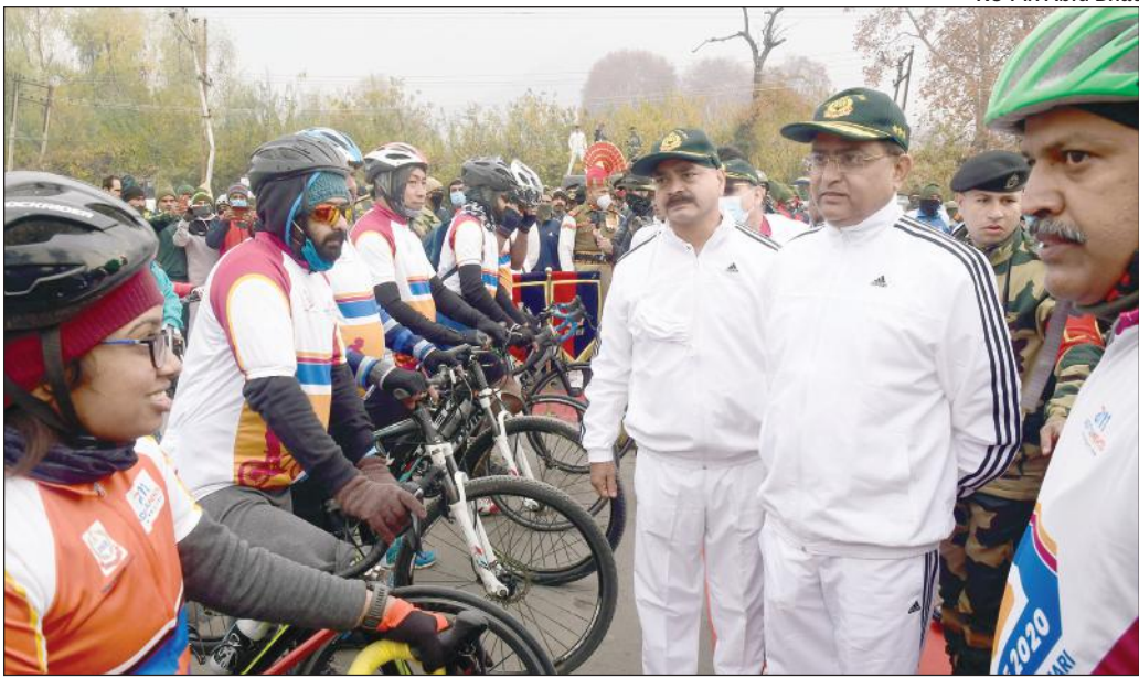
Kashmir to Kanyakumari para cycling expedition was flagged off by officials at Dal Lake Boulevard on Thursday.

This data helps companies to assess the likely risk of bribe demands in each country and to design compliance and due diligence programs tailored to that risk, it said.