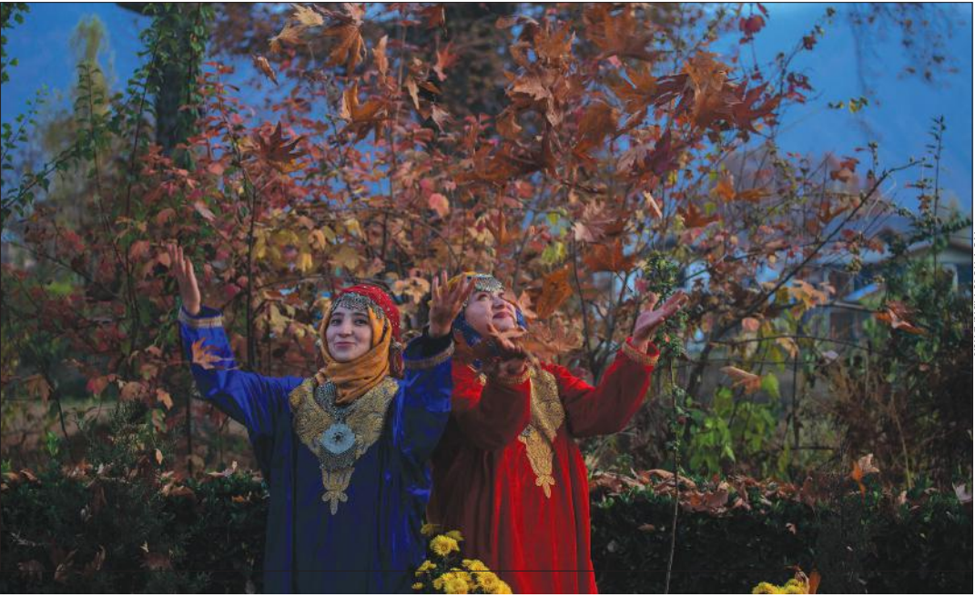
Two tourist girls wearing Kashmiri attire play with Chinara leaves inside a Mughal Garden here on Monday.