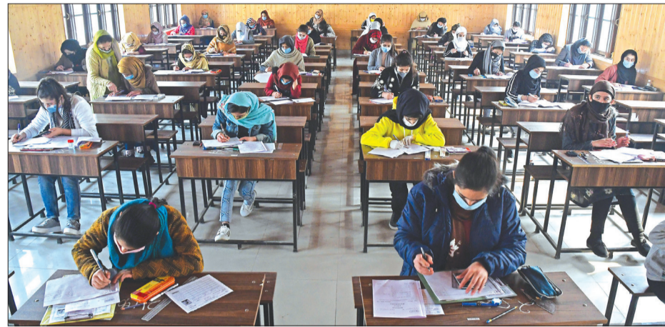
NO Photo Add Bhut

Her remarks came in light of the Supreme Court's observations while hearing the bail plea of Republic TV editor-in-chief Arnab Goswami.