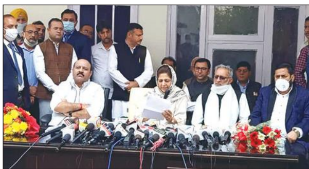
PDP President Mehbooba Mufti addressing media in Jammu on Monday.

"The people in Jammu are more upset and I feel the situation here is worse than in Kashmir. They were misled to believe that Article 370 and Article 35A is a benefit to Kashmiri Muslims and its abrogation will pave the