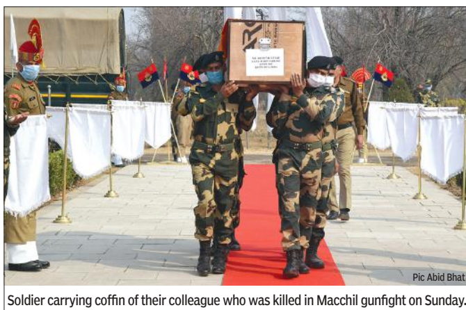
Soldier carrying coffin of their colleague who was killed in Macchil gunfight on Sunday.

"The operation is still on. The area comprises a tough terrain and uneven ground. To rule out the presence of any other militant, a sanitisation operation is on in the area. We will satisfy ourselves that no militant is there," Additional Direc-