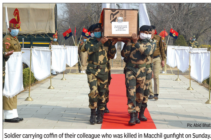
Soldier carrying coffin of their colleague who was killed in Macchil gunfight on Sunday.

"The operation is still on. The area comprises a tough terrain and uneven ground. To rule out the presence of any other militant, a sanitisation operation is on in the area. We will satisfy ourselves that no militant is there," Additional Direc-