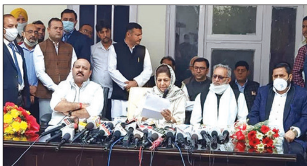
PDP President Mehbooba Mufti addressing media in Jammu on Monday.

"The people in Jammu are more upset and I feel the situation here is worse than in Kashmir. They were misled to believe that Article 370 and Article 35A is a benefit to Kashmiri Muslims and its abrogation will pave the