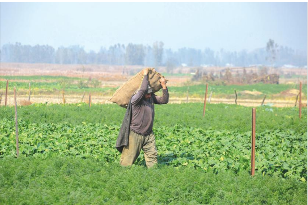
BUSINESS USUAL: A farmer shouldering sack full of collard from his sprawling vegetable garden perched in Srinagar outskirts on Wednesday.