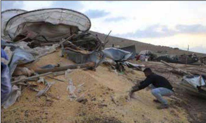
A Palestinian bedouin tries to stop the spillage of grains after Israeli soldiers demolished tents and structures in an area east of the village of Tubas, in the occupied West Bank, on November 3, 2020 AFP

Jerusalem: Palestinian prime minister Mohammed Shtayyeh accused Israeli troops of having 'completely demolished the village of Homsa al-Baqia, leaving around 80 people homeless' Israel's army has demolished the homes of nearly 80 Palestinian Bedouins in the occupied West Bank, officials and witnesses said on Wednesday, in a rare operation targeting an entire community at once. Late Tuesday, Israeli bulldozers razed the village -- including tents, sheds, portable toilets and solar panels -- near Tubas in the Jordan Valley, according to an AFP photographer at the scene, who found dozens of people left homeless.