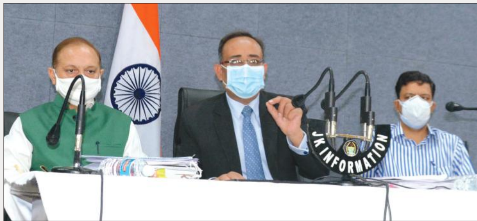
Observer News Service

JAMMU: Amidst an outcry over the newly introduced land laws in Jammu and Kashmir, the Union Territory administration on Monday said that the new land rules will not only afford protection to over 90% of the land from being alienated to outsiders but will also help revamp the agriculture sector foster, rapid industrialization, aid economic growth and create jobs in J&K.