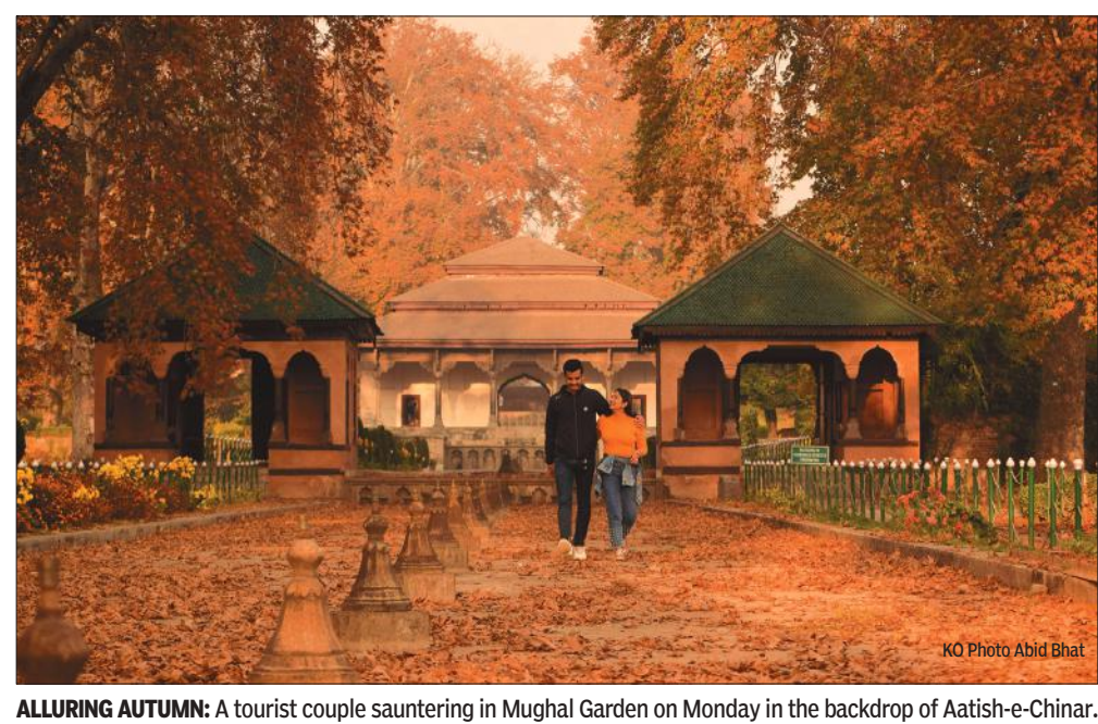
ALLURING AUTUMN: A tourist couple sauntering in Mughal Garden on Monday in the backdrop of Aatish-e-Chinar.

With these deaths, the fatality count has reached 1493 in J&K—993 in Valley ● PAGE 02