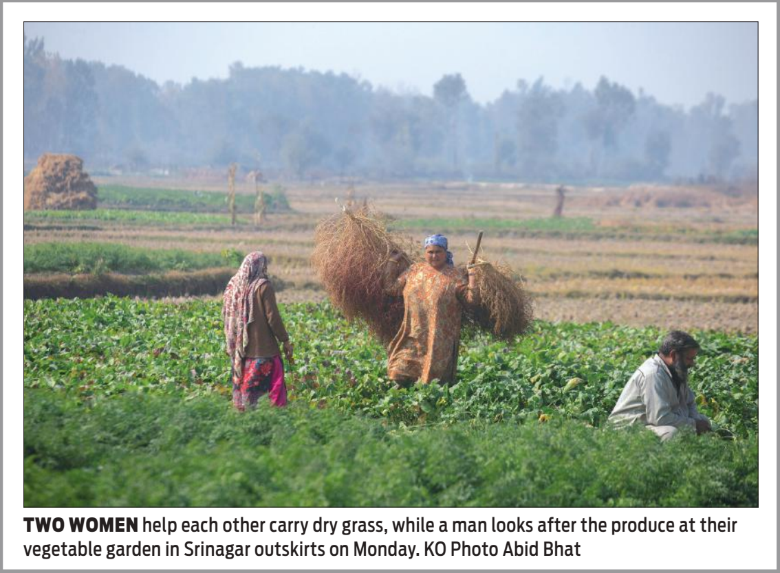
TWO WOMEN help each other carry dry grass, while a man looks after the produce at their vegetable garden in Srinagar outskirts on Monday.