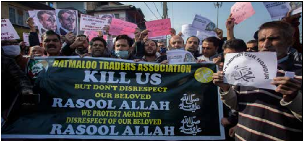
Protests were held in Srinagar on Friday against the French President Emmanuel Macron’s anti-Islam remarks.

Srinagar: Protests were held in Srinagar, Kargil and other major towns across Kashmir on Friday against the French President Emmanuel Macron’s recent remarks against Islam and his support for blasphemous caricatures of holy prophet. Several traders and residents in Batamaloo here protested against Macron and condemned the blasphemy. The protest was organized by All Traders and Transporters Joint Action Committee Batamaloo. Holding placards that read, “Kill us but don’t disrespect our prophet”, the protesters said that they will continue this protest until he (Macron) apologizes to the Muslims. Protest was also held in Kargil district of Ladakh against French president. Eyewitnesses said that soon after offering Friday prayers, hundreds of people held a protest demonstration against the French President. Protestors while carrying placards, raised slogans and marched through the streets of Kargil, they added.