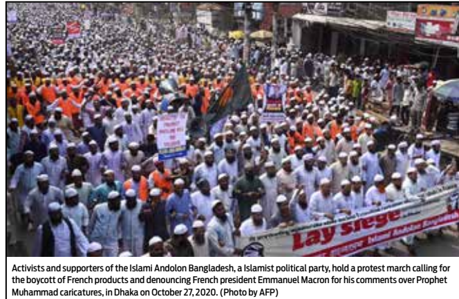
Activists and supporters of the Islami Andolon Bangladesh, a Islamist political party, hold a protest march calling for the boycott of French products and denouncing French president Emmanuel Macron for his comments over Prophet Muhammad caricatures, in Dhaka on October 27, 2020.

On Monday, hundreds of people staged rallies outside the