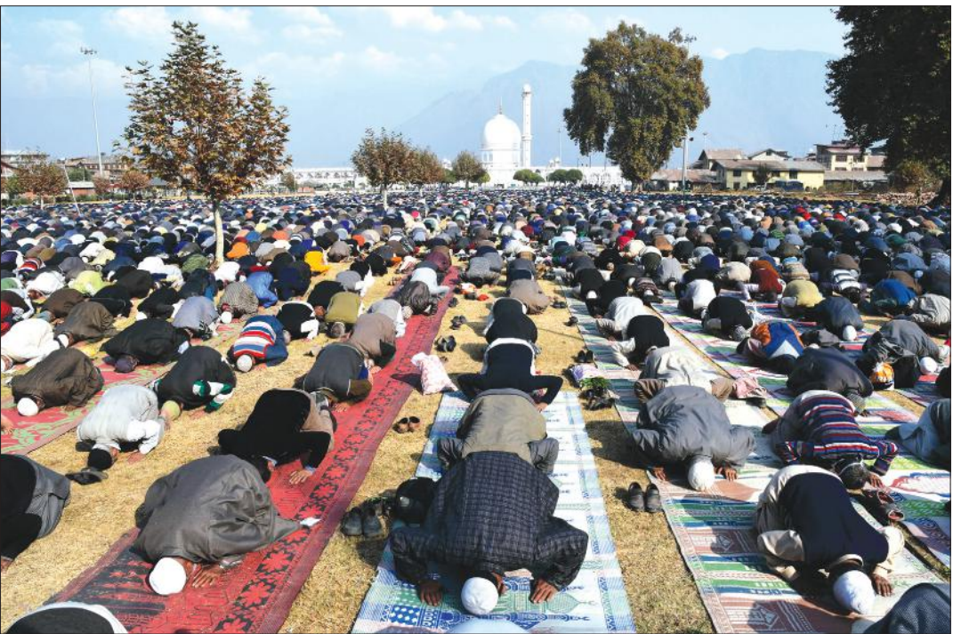
DEVOTEES following Covid protocol offer Friday prayers on Eid-e-Milad-un-Nabi at Hazratbal Shrine in Srinagar...