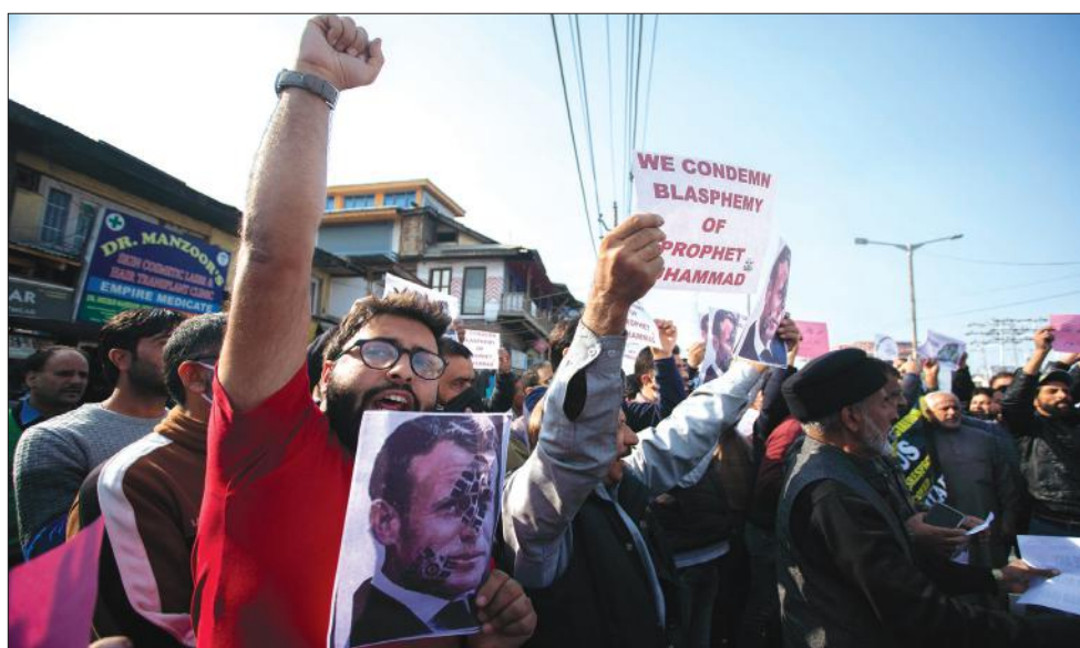
MEMBERS OF BATAMALOOO TRADERS ASSOCIATION shout slogans during a protest against the publications of a cartoon of Prophet Mohammad (PBUH) in France and French President Emmanuel Macron's comments, in Srinagar..

During his service career spanning around 30 years, ● P-02