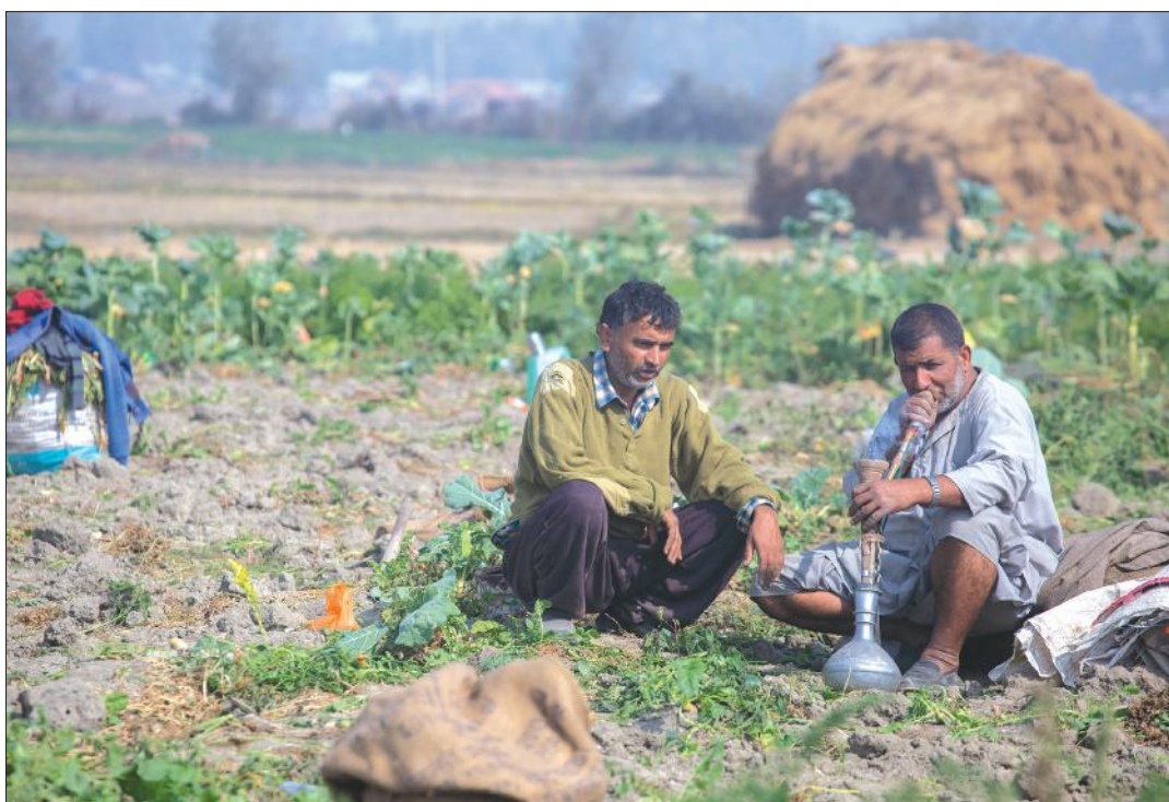
TWO MEN SMOKING hubbal babbal at a vegetable field in Srinagar outskirts on Wednesday.

The CBDT further said the beneficiaries had been found to have made huge investments in real estate properties in prime cities and in fixed deposits to the tune of several hundred crores of rupees. PTI