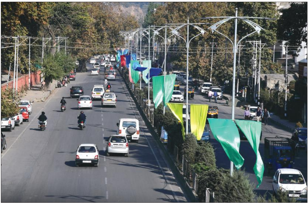
COLOURING CITY: LG Manoj Sinha on Thursday announced the 'My Town My Pride' programme, starting from October 19.

MUMBAI: TV viewership rating agency BARC India has accused Republic TV of misrepresenting its private and confidential communication, saying it has not commented on the ongoing investigation into the alleged manipulation of ratings. In a statement, Broadcast Audience Research Council (BARC) said it was cooperating with the law enforcement agencies in their ongoing investigation in the Television Rating Points (TRP) manipulation case. Responding to claims by Republic TV that an email from BARC gives proof of the channel not being involved in any alleged malpractices, the agency said it was "highly disappointed" with the broadcaster's actions. "BARC India is highly disappointed with the actions of the Republic Network by disclosing private and confidential communications and misrepresenting the same. "BARC India reiterates that it has not commented on the ongoing investigation and without prejudice to BARC India's rights, it expresses its dismay at the actions of the Republic Network," it said.