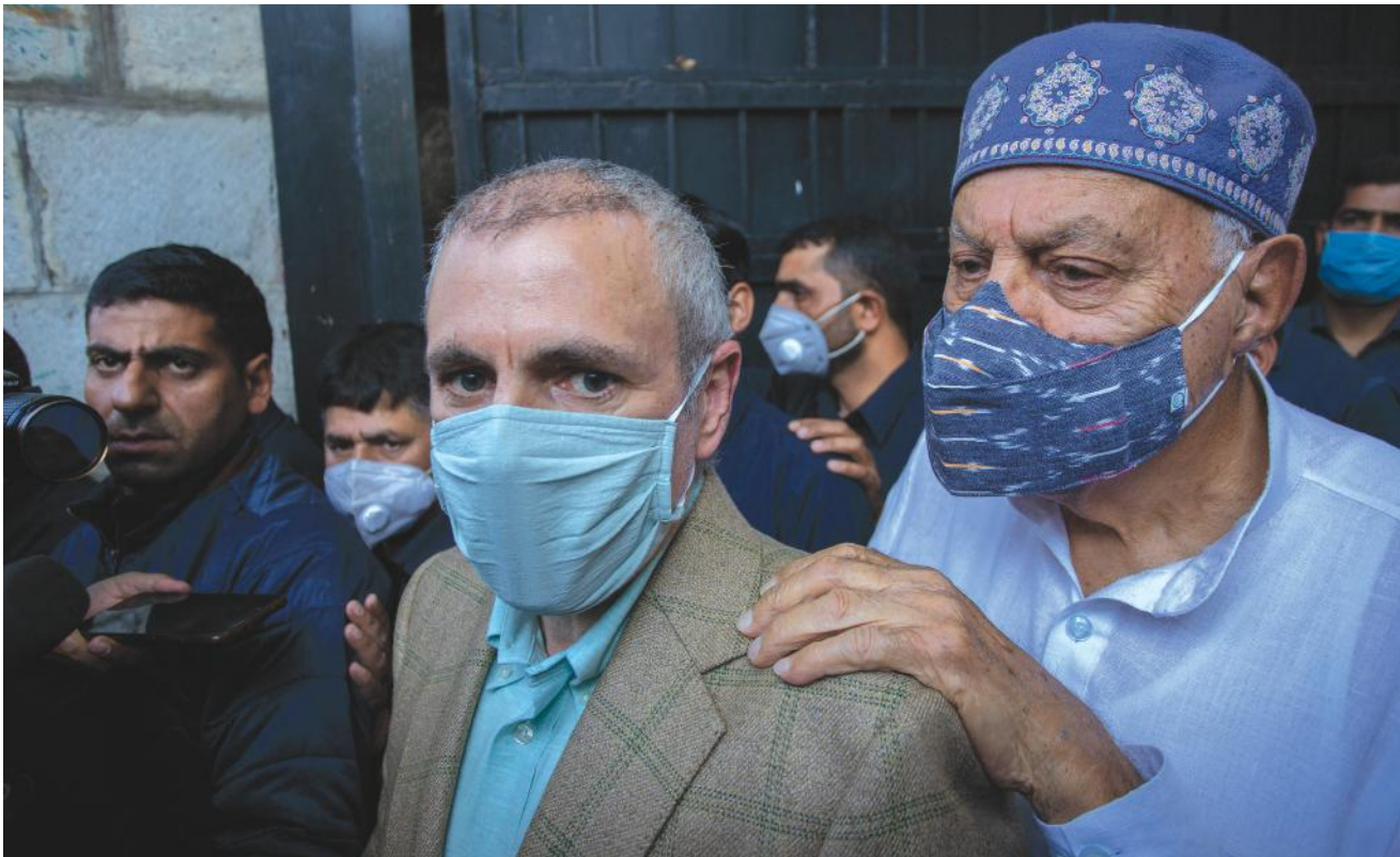
NC Patron Farooq Abdullah and his son Omar leaving PDP President Mehbooba Mufti's residence after meeting her on Wednesday.

It said timely action by alert troops averted the infiltration bid. "Area search and surveillance (is) under progress," it added.