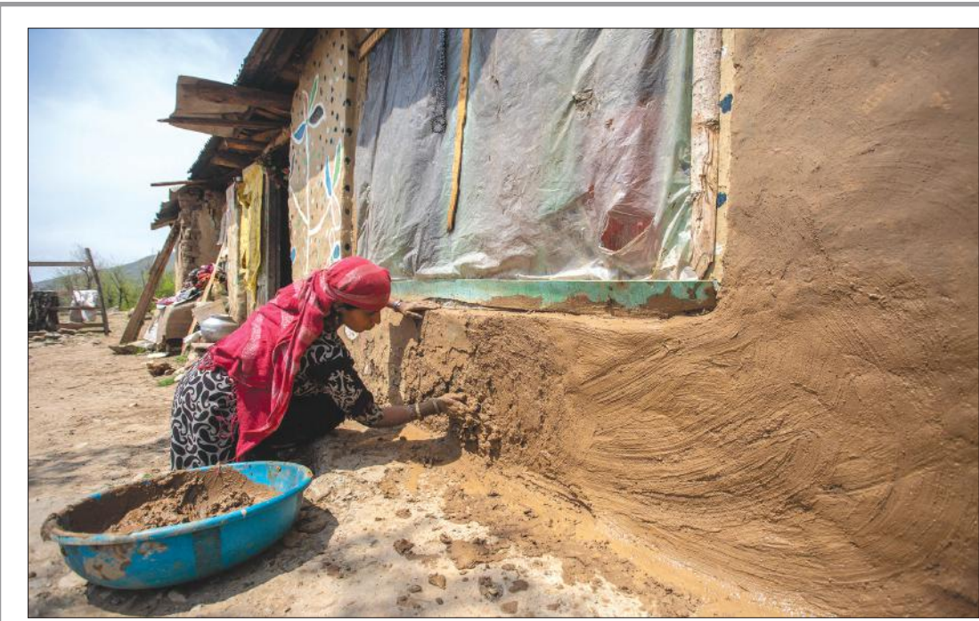
WINTER IS COMING: A Kashmiri woman applying a fresh mud-coat on the outer walls of her house on Wednesday in Srinagar outskirts.