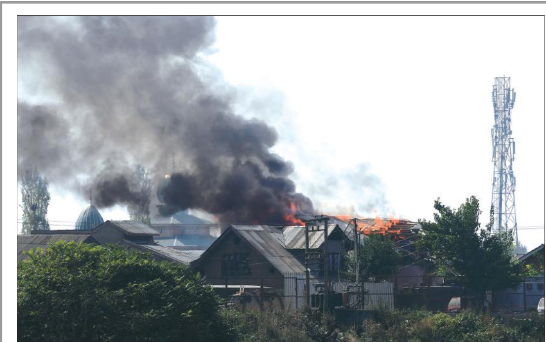
SMOKED SHELTER: Encounter site in Srinagar's Barzulla area rising up in flames on Monday as state forces killed two Lashkar militants in an early morning gunfight.