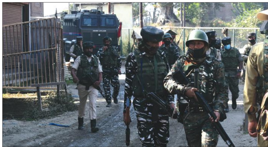
STATE FORCES leaving Barzulla locality after killing two militants in a gunfight on Monday.