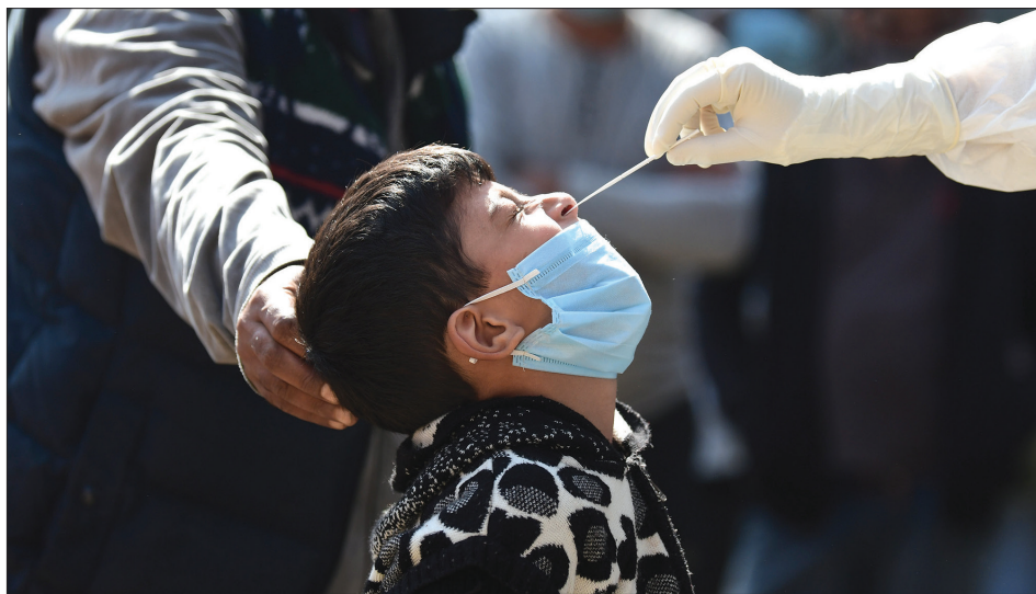
A HEALTH WORKER taking nasal swab of a boy for Coronavirus test in Srinagar on Tuesday.

WITH IMMEDIATE EFFECT, THE ACTS MENTIONED IN the schedule to this order shall, until repealed or amended by a competent legislature or other competent authority, have effect, subject to the adaptations and modifications directed by the said schedule, or if it is so directed, shall stand repealed.