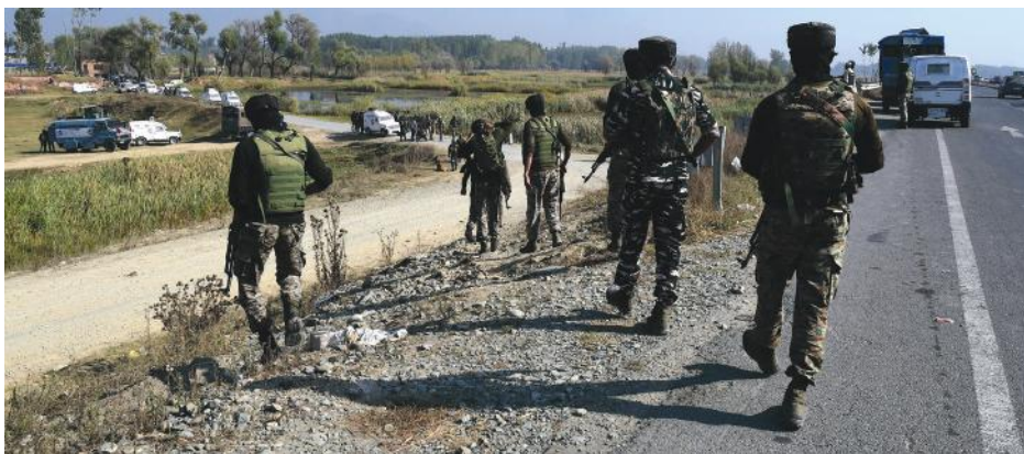
Militants first fired upon a paramilitary forces party near Kandizal Bridge on Nowgam bypass.

A majority of people in urban and rural parts prefer government/public hospitals for treatment. 77 percent of people in the rural area chose government/public hospital for treatment and in urban areas, it was 50.5 percent. ►PAGE 02