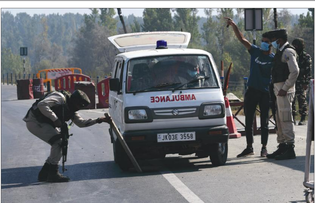
SEARCH AFTER STRIKE: After two CRPF men were killed in a militant attack in Saffron town Pampore, forces heightened vigil on highway on Monday.

and strengthen cooperation in areas of mutual interest". "Due to the ongoing COVID-19 situation, few direct exchanges have taken place between the two sides. This visit will provide an opportunity to take stock of the existing bilateral ties and strengthen cooperation in areas of mutual interest," a Ministry of External Affairs release had said. India attaches high priority to its relationship with Myanmar in accordance with its 'Neighborhood First' and 'Act East' policies, the MEA said.