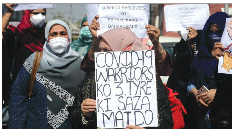
SKIMS nursing staff holding a protest at Srinagar's Press Colony on Monday against the administration's newly introduced three-tier shift.

is not possible unless New Delhi doesn't do justice with the people of J-K and reverses all the decisions taken on the 5th of August, 2019,"