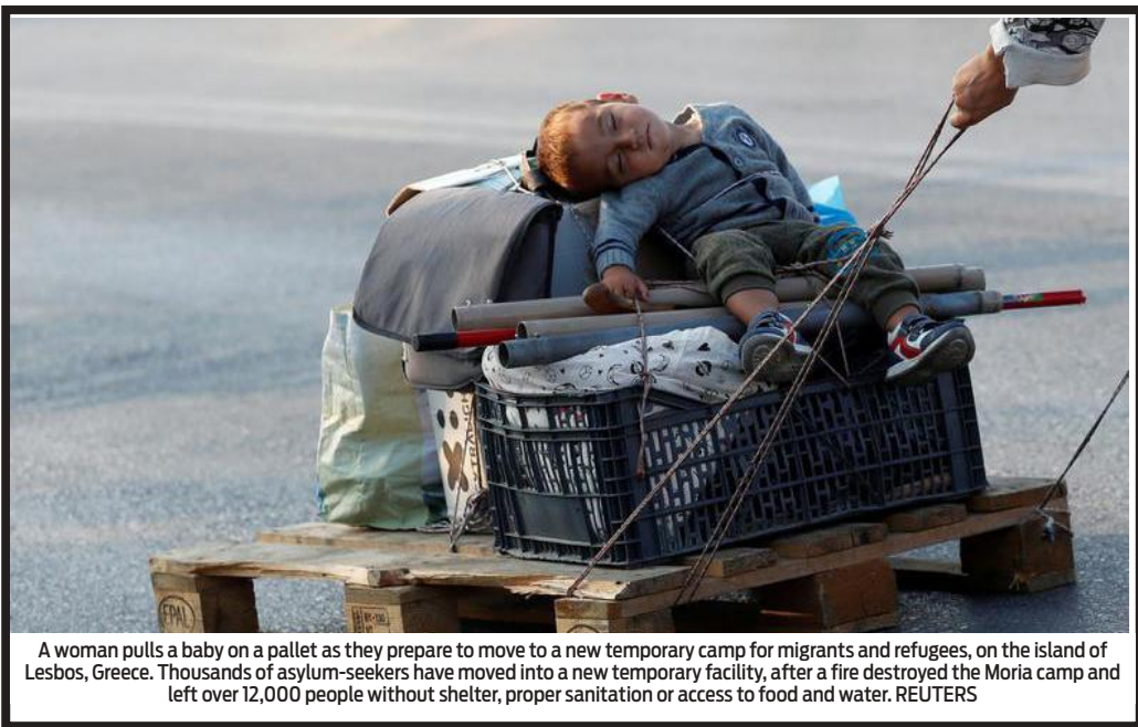
A woman pulls a baby on a pallet as they prepare to move to a new temporary camp for migrants and refugees, on the island of Lesbos, Greece. Thousands of asylum-seekers have moved into a new temporary facility, after a fire destroyed the Moria camp and left over 12,000 people without shelter, proper sanitation or access to food and water.

The body of the plane burst into flames on landing and firefighters were able to extinguish the blaze after an hour. The town of Chuhuiv is around 30 kilometres southeast of Kharkiv and 100 kilometres west of the front line where government forces are fighting pro-Russian separatists. The presidency said that according to preliminary information the transport plane crashed during a training flight. The EU's top diplomat Josep Borrell sent his condolences on behalf of the bloc. "My thoughts are with the families and friends of those who lost their lives," he tweeted. Several military planes have crashed in Ukraine during training flights in recent years. A pilot was killed in December 2018 after his Su-27 fighter crashed during landing in the Zhytomyr region.