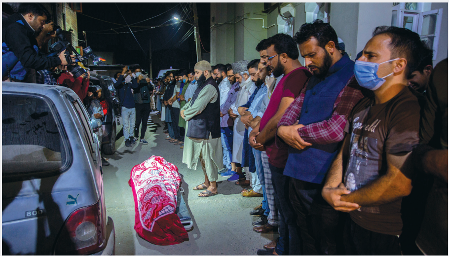
KO PhotoBhat Bhat