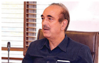
the reconstituted working committee.