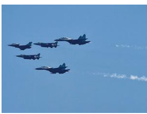
Air Force Station in Ambala.

Indian Air Force personnel march past a Rafale jet during its induction ceremony into the Indian Air Force at the Ambala Air Force Station.