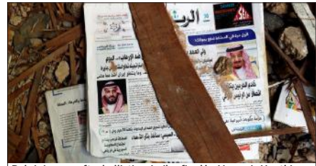
Debris is seen after ballistic missiles fired by Yemen's Houthi militia fell on a house in Riyadh, Saudi Arabia, March 26, 2018.

The group have attacked Riyadh several times before.