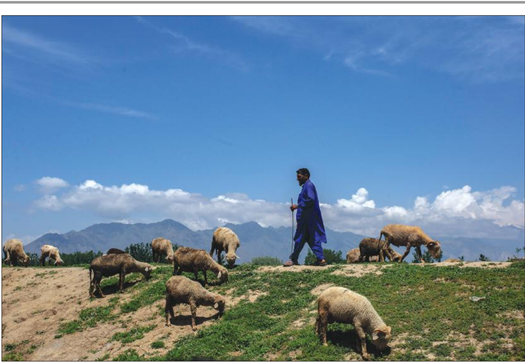
A SHEPHERD taking his flock to a pasture in South Kashmir's Anantnag district on Thursday.

On September 3, another bench had heard the same pleas and had passed an order urging the press to show restraint while covering the developments of Sushant Singh Rajputs death case.