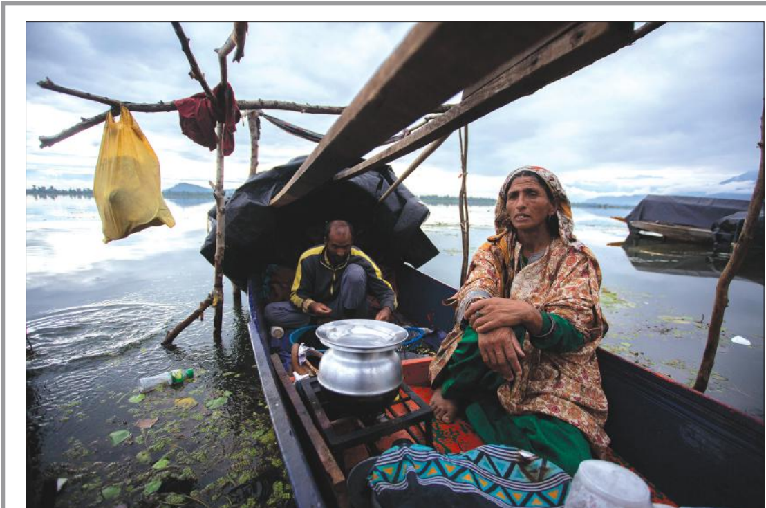
A FISHERMAN docks his boat on Dal banks on Foreshore Road to take a break for lunch.