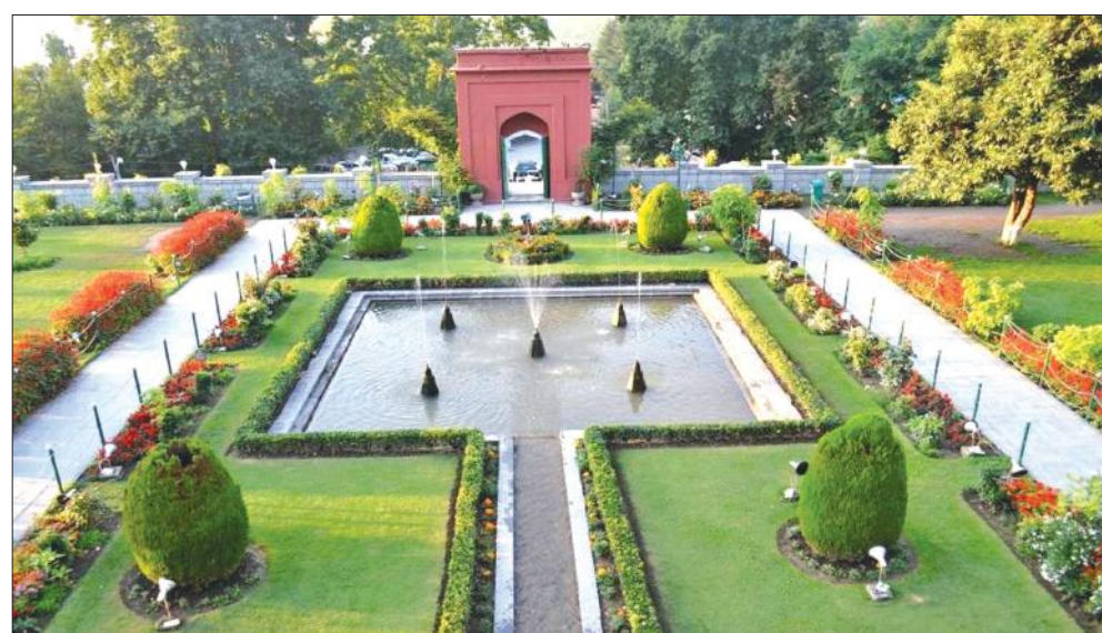
MUGHAL GARDENS Slated To Be Included Into UNESCO World Heritage List.

apprised the Lt Governor about various welfare issues of Kashmiri Pandit community including permanent rehabilitation of Kashmiri Pandits, enhancement of relief amount, financial package