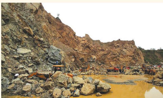
Pointing out to the fact that their quarries were visible from DPS's rear side, the miners accused the former PDP-BJP government of play-