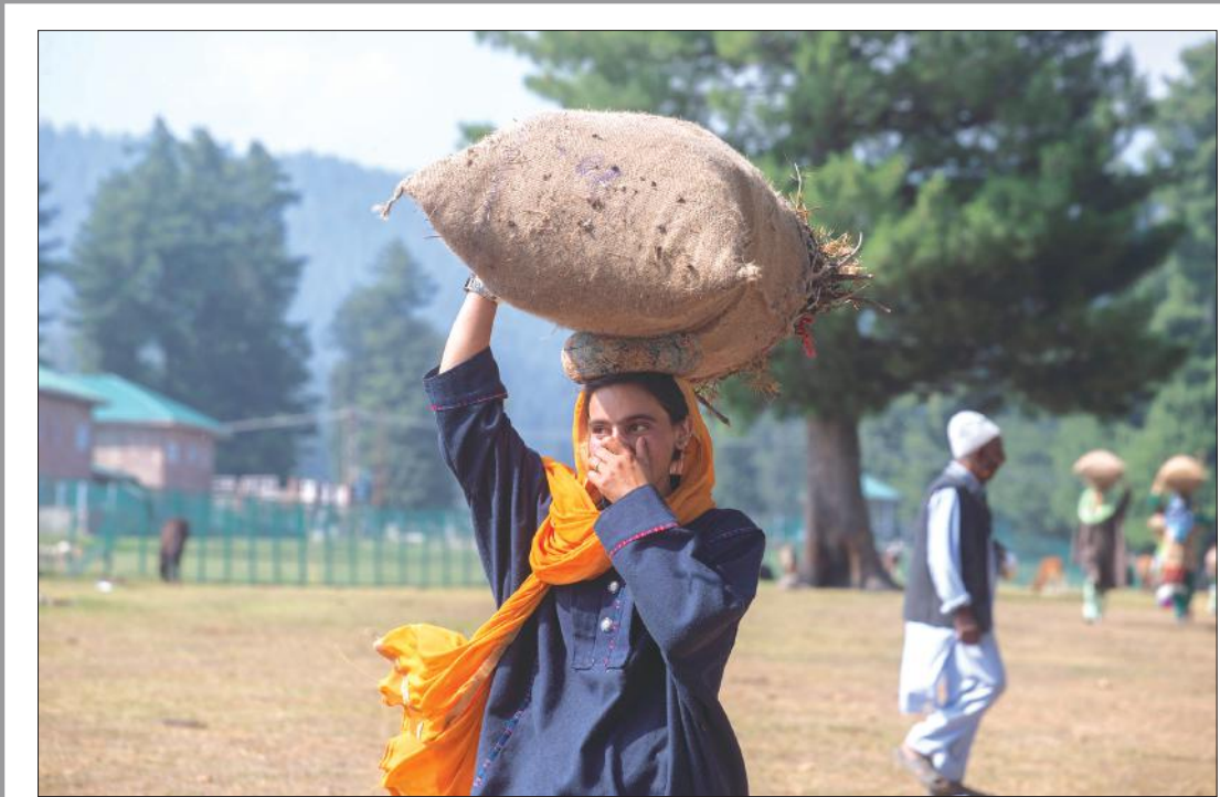
A VILLAGE damsel heads home after a hectic day in the fields in central Kashmir

"I hinted at the need to keep a close watch on affairs of Sri Lanka and Nepal and also the Chinese interventions in general," he added. Vijay Gokhale spoke about the history of Indo-China relationship, especially the border disputes. The former foreign secretary shared his views on the current situation on the Line of Actual Control (LAC), Mr Pawar said. Air Marshal Gokhale emphasized that India must take into consideration the new era of parallel warfare that includes cyber war, information war, perception creation and war on economic fronts, the NCP president added.