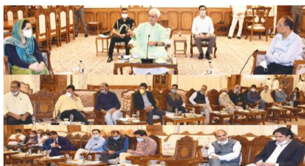
the Union Territory of Jammu & Kashmir to achieve the mission of inclusive socio-economic development of all. ● PAGE 02

The Lt Governor called for multiplying the efforts in bringing developmental reforms in