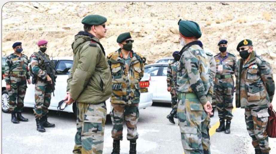
GEN MM NARAVANE visited Leh and reviewed security situation and operational preparedness along the LAC

LAC Tensions Most Serious Since 1962: FS Shringla