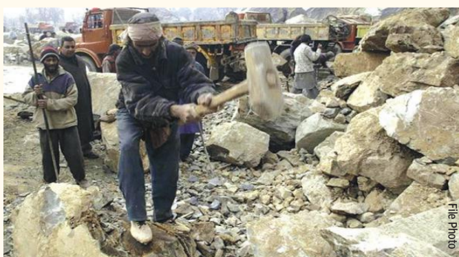
the setback to the stone mining business is not exclusive to this ancient area. From the northern reaches of Pampore to the 'gateway