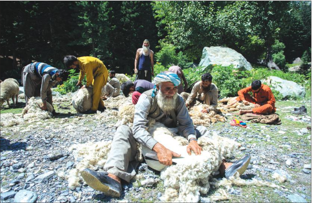
A KASHMIRI nomad works on shearing his sheep in central Kashmir.