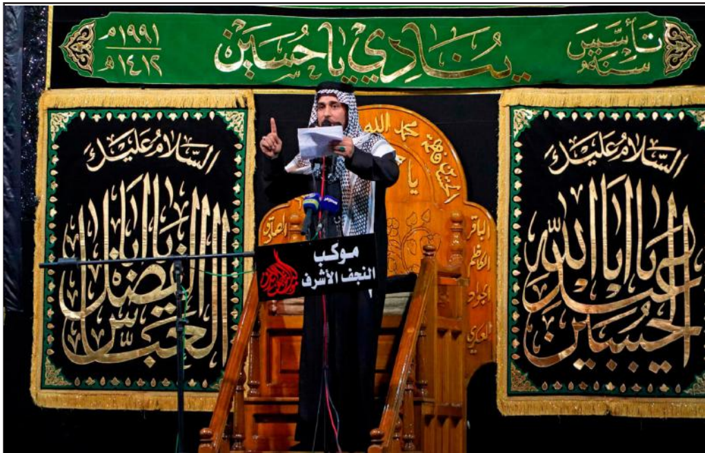
A man reads a speech as Iraqis gather to commemorate the 4th day after Ashura in the holy city of Najaf

bare a lie by Pakistan about Indian nationals in the 1267 Al Qaeda Sanctions List of the UN Security Council. In response to the remark by Pakistan that it submitted names of the four Indians to be proscribed under the Sanctions List, India had said the Sanctions List is "public and the world can see none of these individuals are in it. The 1267 Committee works on the basis of evidence and not random accusations thrown in to divert their time and attention".