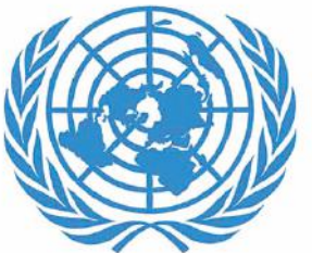
UN Security Council

He added that the Council has met thrice during the last one year to consider the situation in Jammu and Kashmir.