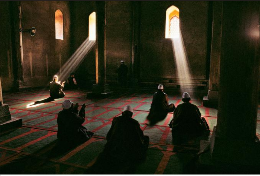
National Geographic, September 1999, Kashmir: Trapped in Conflict

Through the Islamic Lens The Islamic word for Atheism is Il-haad, which literally means “deviation”. The word Ilhaad is derived from an Arabic root word lahad, which is used to describe the grave where a trench is dug straight into the ground and then a side pocket is carved for the deceased. The side pocket marks a deviation from the main trench. So, in this sense Atheism is considered a deviation from the natural or straight path. From the Islamic perspective, Atheism could be said to have emerged from the 8thcentury Dahriyy-