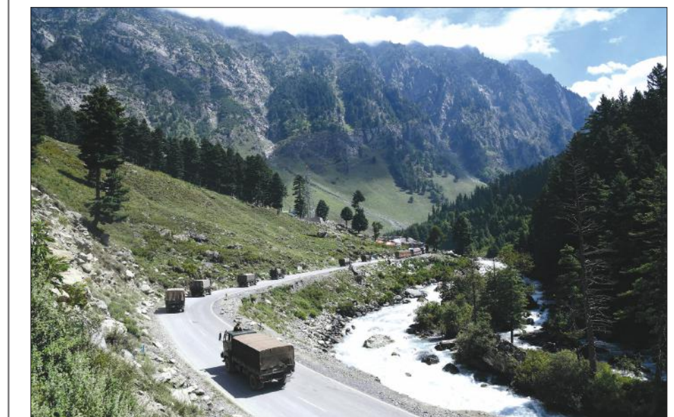
SCENIC SRINAGAR-Ladakh highway these days is witness to increased military movement with its usual commuters, nature lovers and picnickers confined to their homes.

2 Doctors Among 641 New Covid-19 Cases Two doctors and fifty-six travellers were among 641 new novel coronavirus cases reported in Jammu and Kashmir in last 24 hours, taking the overall tally of the Covid-19 infected to 38864 in J&K. Among the fresh cases, sources said 274 were from ● P-02