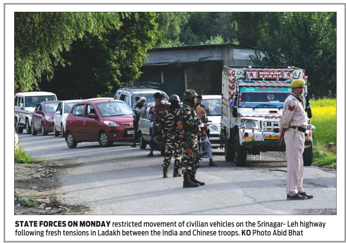
STATE FORCES ON MONDAY restricted movement of civilian vehicles on the Srinagar- Leh highway following fresh tensions in Ladakh between the India and Chinese troops.

to remain suspended in India since March 23 due to the coronavirus pandemic. Meanwhile, special international flights have been operating under the Vande Bharat Mission since May and under bilateral air bubble arrangements with other countries since July. The circular said the suspension does not affect the operation of international all-cargo operations and flights specifically approved by the DGCA.