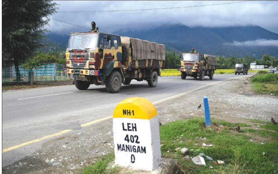
AN ARMY CONVOY heading towards Ladakh on Monday as tensions between India and China continues to rise.

Army Spokesperson Col Aman Anand said troops from China's People's Liberation Army (PLA) "violated" the consensus arrived at during military and diplomatic engagements on the ongoing stand-off in eastern Ladakh, and carried out provocative military movements to change the status quo. Government sources said a sizeable number of Chinese troops were moving towards the southern bank of Pangong Tso lake in an attempt to occupy the area but the Indian Army quickly made significant deployment to foil the bid. The sources said there was no