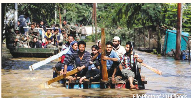
File Photo of 2014 floods

Scientists Humayun Rashid and Gowhar Naseem, in their 2008-published paper, had warned that the breakdown of the natural discharge system due to the degradation of the network of lakes could prevent