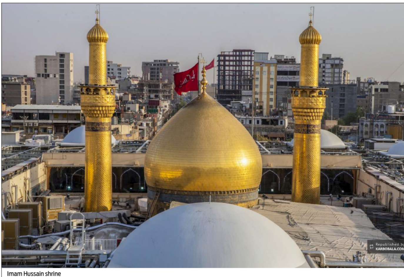
Imam Hussain shrine