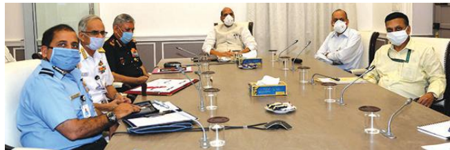
Doval, Chief of Defence Staff Gen Bipin Rawat, Army Chief Gen MM Naravane, Navy Chief Admiral Karambir Singh and IAF Chief Air Chief Marshal RKS Bhadauria. The sources said all ►PAGE 02

The meeting was attended by National Security Advisor Ajit