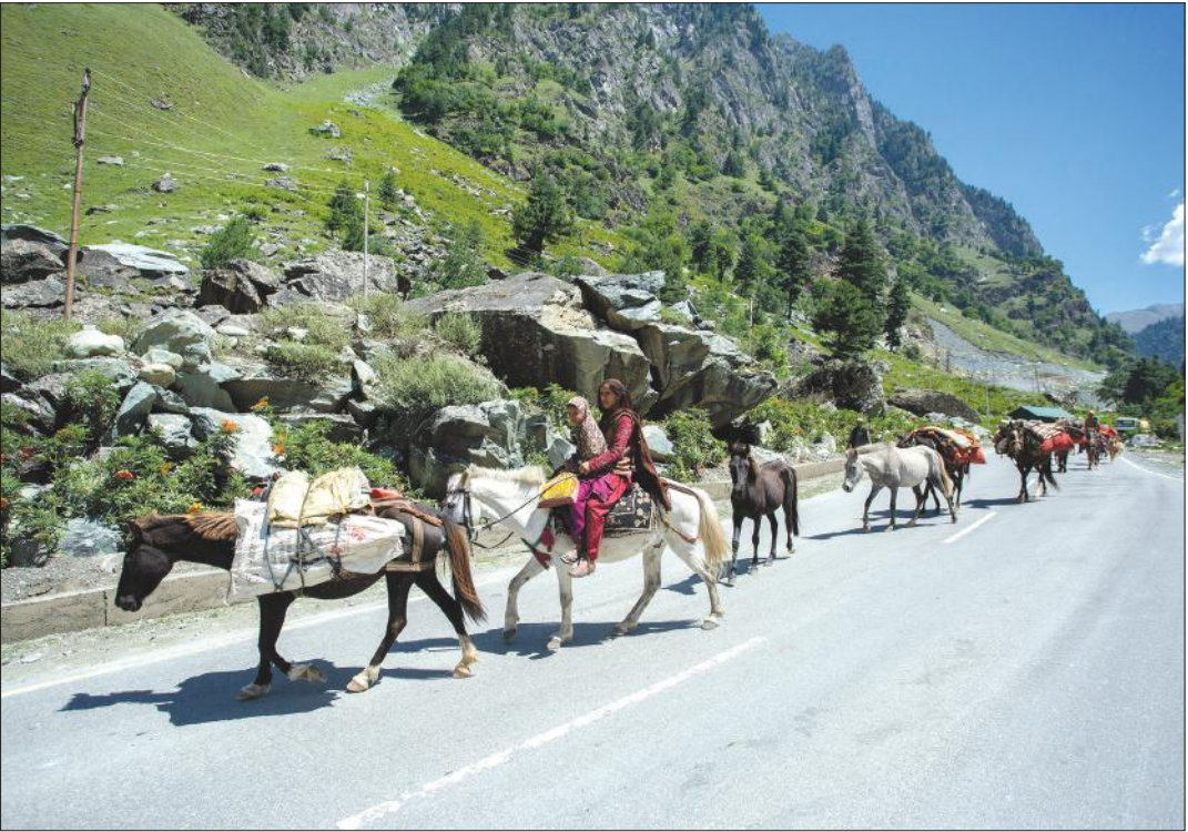
BAKERWALS, Kashmir's nomadic tribe has started moving back to warmer planes earlier than usual this year