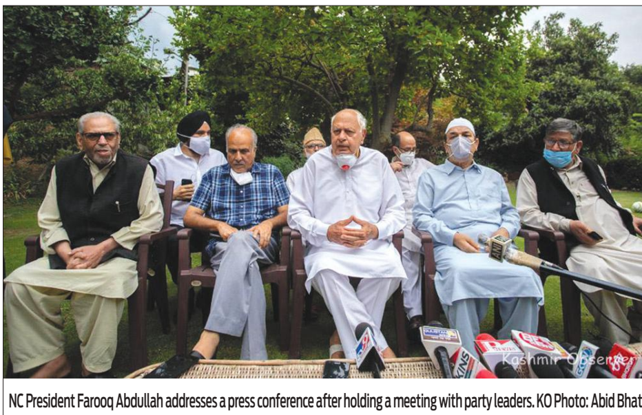
NC President Farooq Abdullah addresses a press conference after holding a meeting with party leaders.

The joint statement on 'Gupkar Declaration' comes over two weeks after NC patron unsuccessfully tried to hold all party meet at his Sonwar residence on August 5 anniversary ►PAGE 02