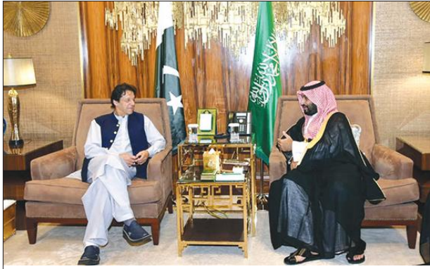
PAK PREMIER Imran Khan with Saudi Crown Prince Muhammad bin Salman. File photo

It reported that Bajwa conveyed regret over comments made by Pakistan's Foreign Minister Shah Mahmood Qureshi which angered the Saudis. Qureshi in an unusually sharp warning asked Saudi Arabia-led Organisation of Islamic Cooperation (OIC) early this month