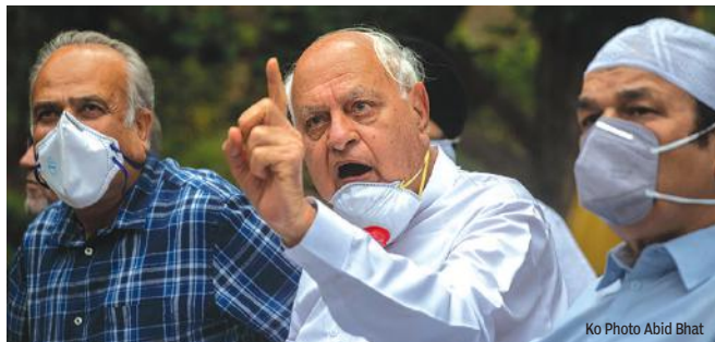
Ko

"The aim of today's meeting was to ensure that the four leaders were free. We will discuss and review the political agenda once all political leaders are set free," Abdullah said. The Lok Sabha member was talking