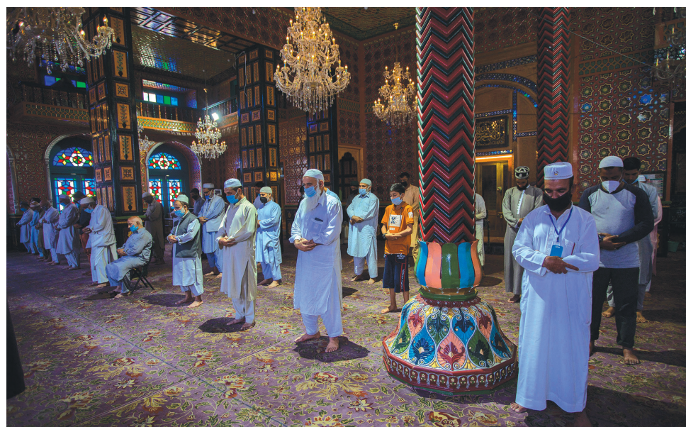
DEVOTEES OFFER PRAYERS inside the shrine of Dastgeer Sahib (RA) shrine on Monday, nearly five months after the religious places were shut down due to Covid-19.

Taking strong note of the blasphemous remarks made by the members of Sentinel Bharat Raksha Manch, an MMU spokesperson said today that some zealots were making a deliberate attempt to hurt the sentiments of Muslims across the world. "It is extremely unfortunate that the anti-Islam forces are being time and again encouraged to indulge in such deliberate provocative acts ● P-02