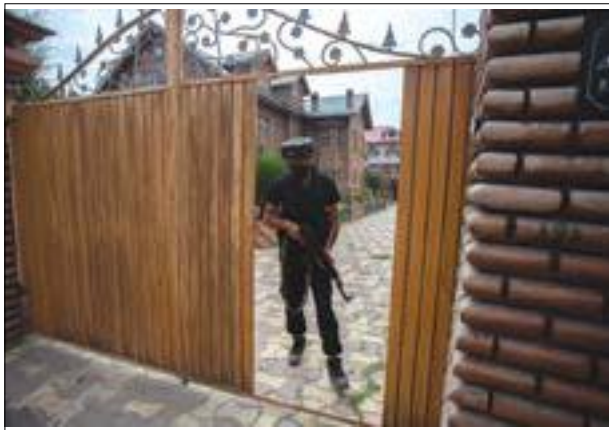
SECURITY personnel searching a house in Nowgam on Friday following a militant attack.