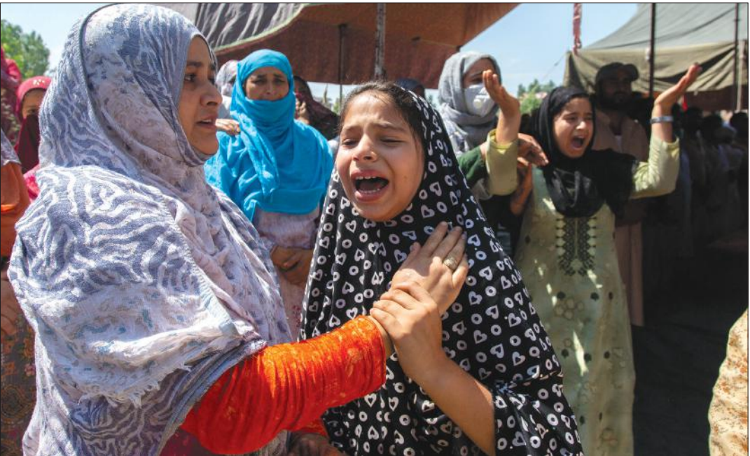
DAUGHTERS GREAF: Family members mourn at the funeral of one of the two slain policemen in Srinagar.

police officer demanded bribe from the truck driver who approached Anti Corruption Bureau Srinagar with a written complaint to this effect. "An FIR vide number 9/2020 was registered in police station ACB Srinagar. Accordingly a trap was laid near Kaman Post Batamalo Srinagar and the Sub Inspector, a resident of Uri Baramulla was caught red handed while receiving the bribe of Rs.3000 in lieu of releasing the documents of the said vehicle which he had retained with him without any reason or rhyme." Subsequently, after obtaining the police remand, the accused has been shifted to police station Shaheed Gunj Srinagar for his lodgement.