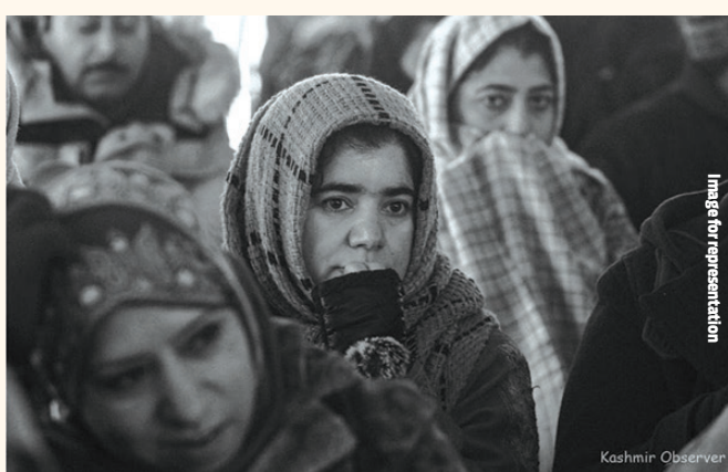
Image for representation