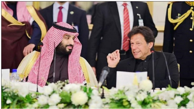
Saudi crown prince Mohammed bin Salman with Pakistan Prime Minister Imran Khan in a file photo

Recently Pakistan's Foreign Minister Shah Mehmood Qureshi during a talk show on a news channel had threatened that if the OIC headed by Saudi Arabia did not convene a foreign ministers' meeting on Kashmir, Prime Minister Imran Khan would