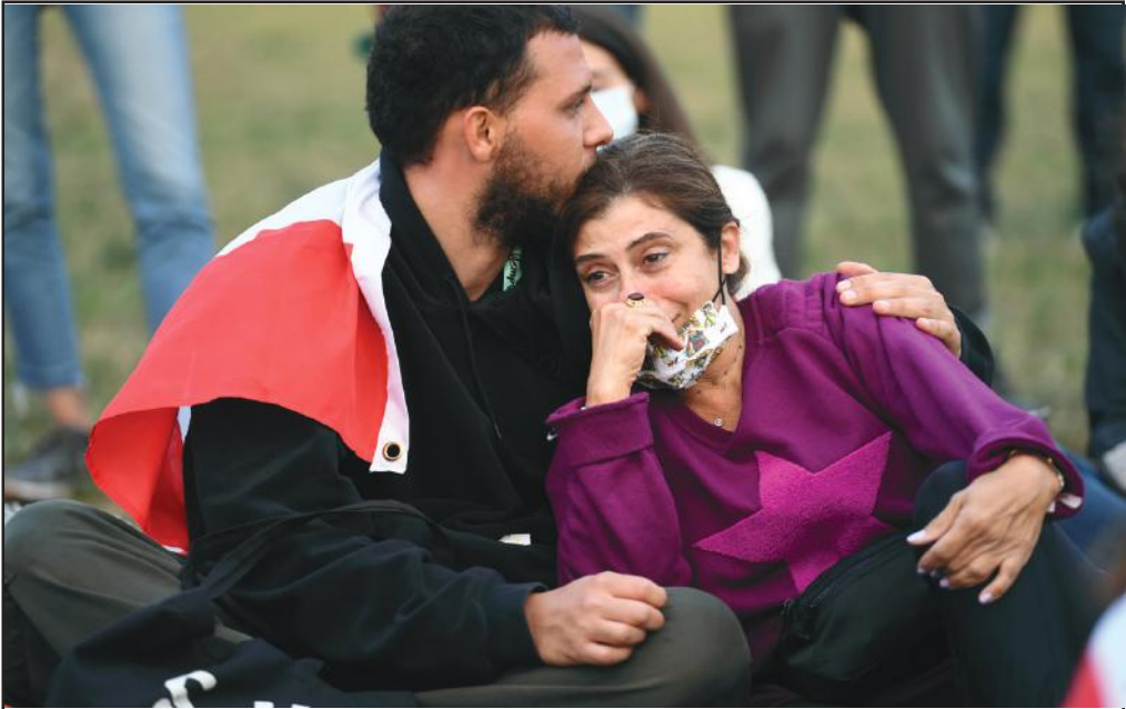
People attend a vigil for the victims of the explosion in the Lebanese capital.

He added, "It is difficult to understand what the U.S. government can do as well, other than putting a group of Syrian regime officials on a list that only provokes indifference on their part."