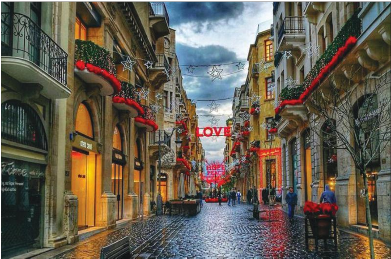
Beirut has evolved under the influence of various civilisations but it has remained a place of love, arts and poetry

Today, Beirut mourns her dead sons and daughters. More than 100 innocent lives were lost in the port blast on Tuesday. The toll may go up. Today, the city is sad and, again, under a state of emergency. As I watch the news and social media videos, I feel numb. Nothing but pain. My Beirut deserves better than this. However, I wouldn't rush to lament the death of Beirut. This is not quite a requiem. As fragile as Beirut is, she still is resilient. The Lebanese trace their roots to the Phoenicians. And like the mythical Phoenix, Beirut will always rise from the ashes.