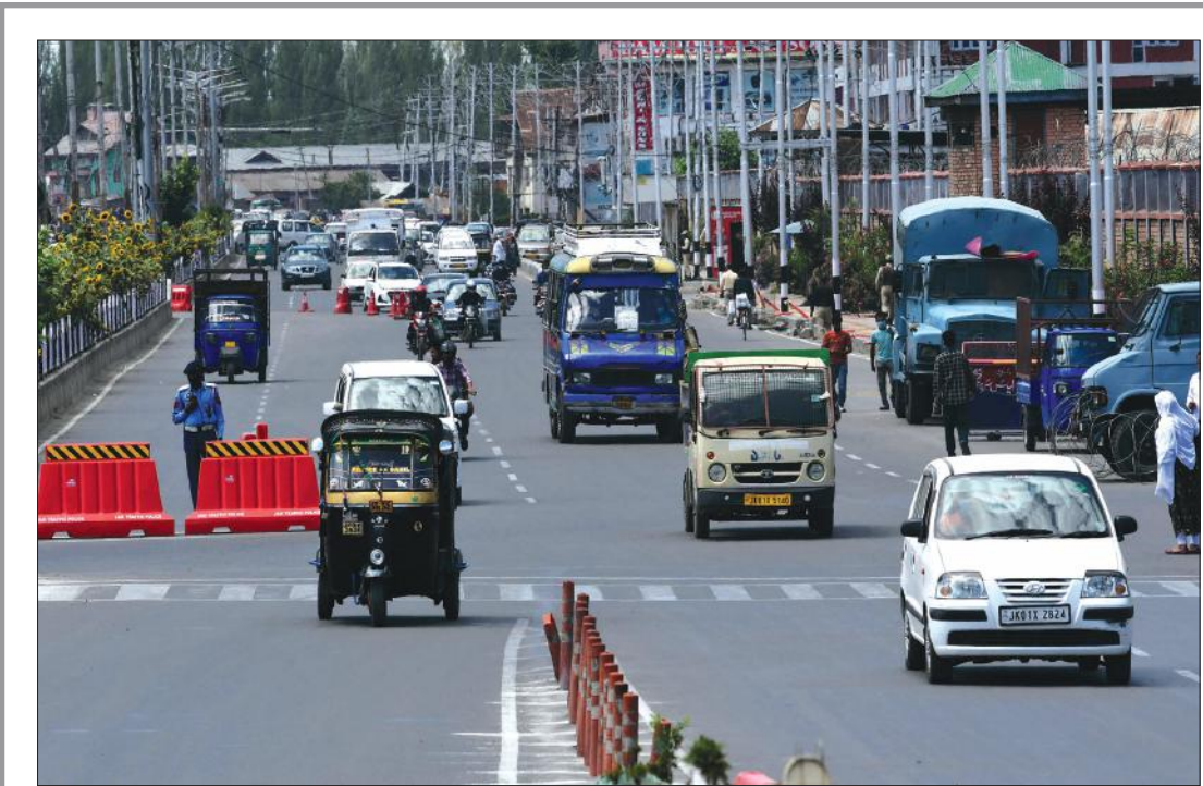
AFTER REMAINING fully shut for three days Srinagar witnessed some life on Thursday-Ko Photo Abid Bhat

age has aided provision of mobility support to 11,821 staff," the health ministry said in a statement. According to the health ministry, this financial aid, as part of the second instalment, will be used for strengthening of public health infrastructure for testing including procurement and installation of RT-PCR machines, RNA extraction kits, TRUENAT and CBNAAT machines. It will also help in the development of ICU beds, the installation of oxygen generators, cryogenic oxygen tanks, and medical gas pipelines in hospitals. The fund will also help to engage, train, and for capacity building of healthcare workforce and volunteers such as ASHAs, on COVID duties. The first instalment of Rs 3,000 crores was released in April 2020 to all States/UTs to aid and enable them to ramp up testing facilities, augment hospital infrastructure, conduct surveillance activities along with procurement of essential equipment, drugs, and other supplies.