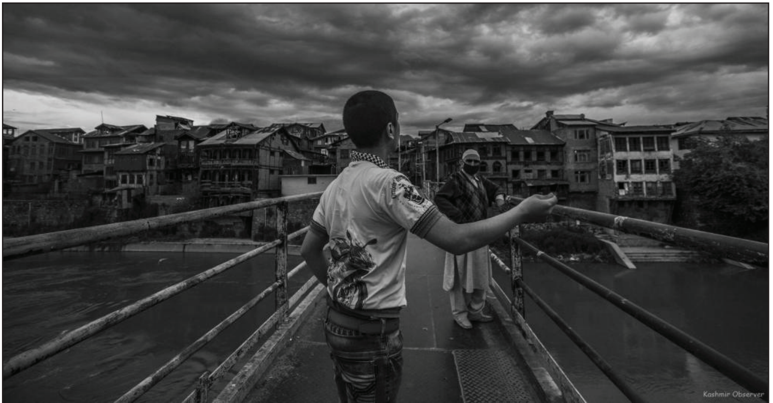
A year after the repeal of Article 370, the choices in Kashmir are now starker than ever before