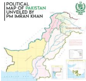
been released by Prime Minister Imran Khan. This is an ● PAGE 02

Kathua, Samba, Bandipora, Reasi, Udhampur, Poonch, Rajouri and Jammu districts are in orange zone and Doda ● PAGE 02