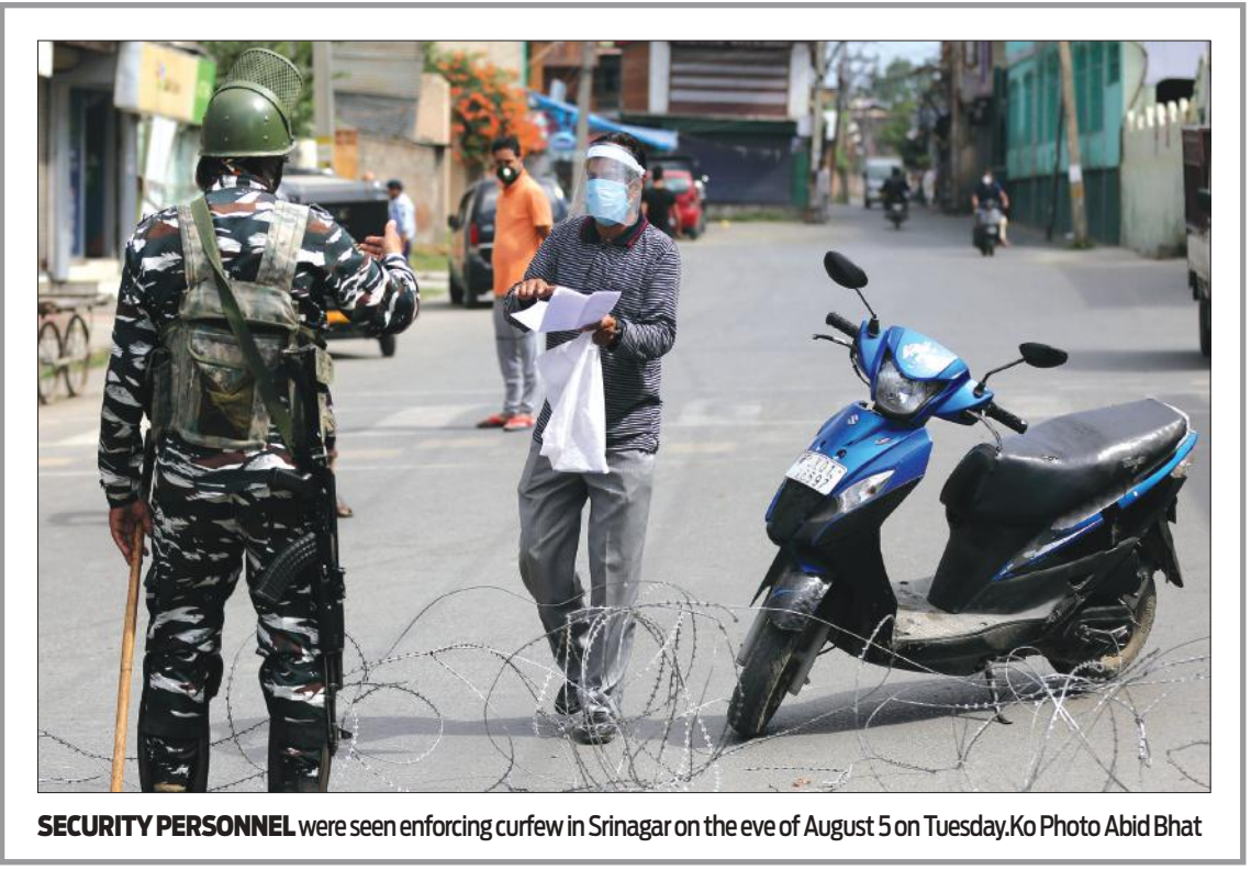
SECURITY PERSONNEL were seen enforcing curfew in Srinagar on the eve of August 5 on Tuesday.

of her mind", the Sena said. There is excitement in the country in view of the 'bhoomi puja' ceremony, the Sena said. "Coronavirus has spread in Ayodhya, Uttar Pradesh and the entire country. This crisis, too, will fade away with the blessings of Lord Ram," it said. The responsibility of security arrangements in Ayodhya was with the Home Ministry, but it is unfortunate that Home Minister Amit Shah tested coronavirus positive, it said. Despite the presence of the Prime Minister, the RSS Chief, Uttar Pradesh Chief Minister and others, the ceremony will be lacklustre without Amit Shah, the Sena said. It said Amit Shah participated in a public event in Delhi last Saturday and attended the cabinet meeting last Wednesday observing social distancing norms, and has asked those who came in his contact in the past few days to isolate themselves and get tested for coronavirus. The entire Council of Ministers needs to be isolated, if the Home Minister is saying this, it said. Amit Shah is close to PM Modi but nothing will happen to the Prime Minister and the Home Minister due the blessings of Lord Ram, it said.