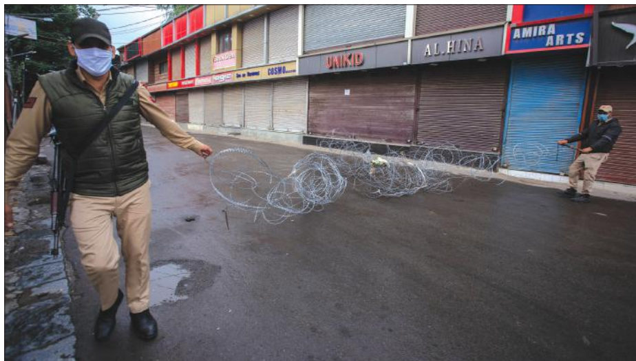
SECURITY PERSONNEL blocking lanes in uptown Srinagar to curb public movement on the eve of August 5

An order was issued by Deputy Commissioner Shahid Choudhury on Tuesday saying that after assessing the situation in the area, it has been decided to prematurely end the curfew which was slated to continue till Wednesday night. The order, however, states that restrictions ordered earlier under Section 144 of the Criminal Procedure Code and ● PAGE 02