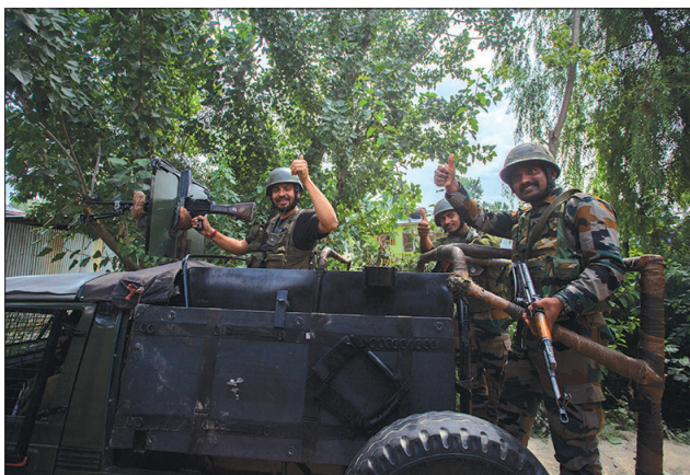
SOLDIERS SMILE as they leave encounter spot in Panzina area on the Srinagar outskirts on Saturday.