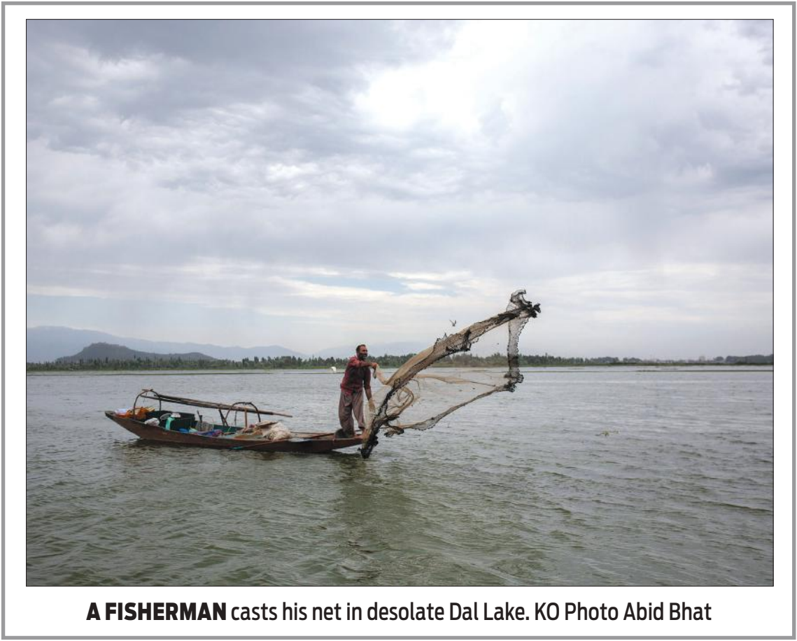
A FISHERMAN casts his net in desolate Dal Lake.

severe cases through a well-executed standard of care protocol has ensured a high rate of recovery among COVID patients. The Centre is handholding and supporting State/UT governments in collectively combating COVID-19,” it said. “One such initiative is e-ICU programme of AIIMS, New Delhi. Aimed at reducing mortality, AIIMS has mentored and supported 43 big hospitals in 11 states through shared experiences and technical advice from domain experts in clinical management of ICU patients,” the ministry said. This has substantially boosted their capacity in treatment of critical care patients, it added. The total number of confirmed cases includes foreigners. According to the Indian Council of Medical Research (ICMR), a cumulative total of 1,40,47,908 samples have been tested up to July 19 with 2,56,039 samples being tested on Sunday. Of the 681 deaths reported in the last 24 hours, 258 were reported from Maharashtra, 91 from Karnataka, 78 from Tamil Nadu, 56 from Andhra Pradesh, 38 from Uttar Pradesh, 36 from West Bengal, 31 from Delhi, 20 from Gujarat and 15 from Madhya Pradesh. The total fatalities in one day include nine from Bihar, eight each from Punjab and Jammu and Kashmir, six each from Rajasthan and Telangana, five each from Haryana and Odisha, four from Assam, three from Jharkhand, two from Kerala, and one each from Goa and Ladakh.