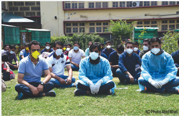
gasping for breath in the Covid-cramped chambers—were told that the hospital is devoid of the "vital drug": Remdesivir.

According to some eyewitnesses, ire erupted in Srinagar's SMHS hospital and targeted the health workers after some attendants—whose patients were